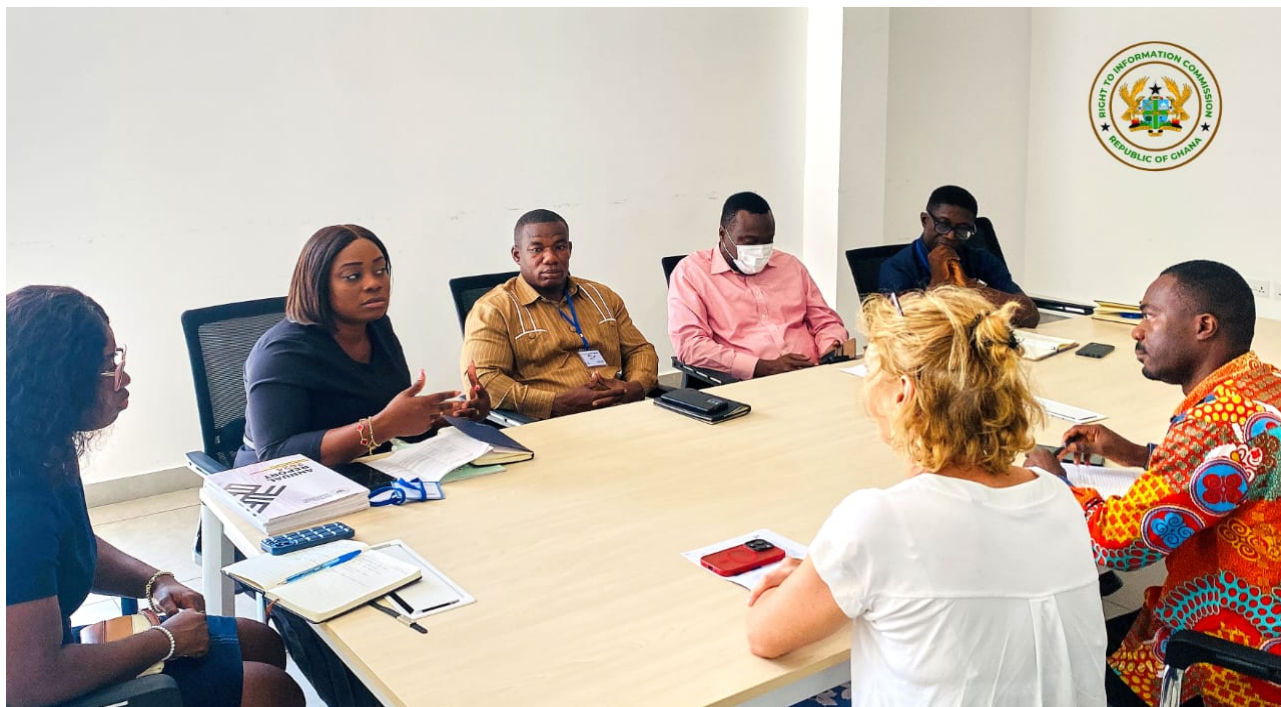
RTIC ENGAGES GIZ GHANA IN A STRATEGIC PARTNERSHIP