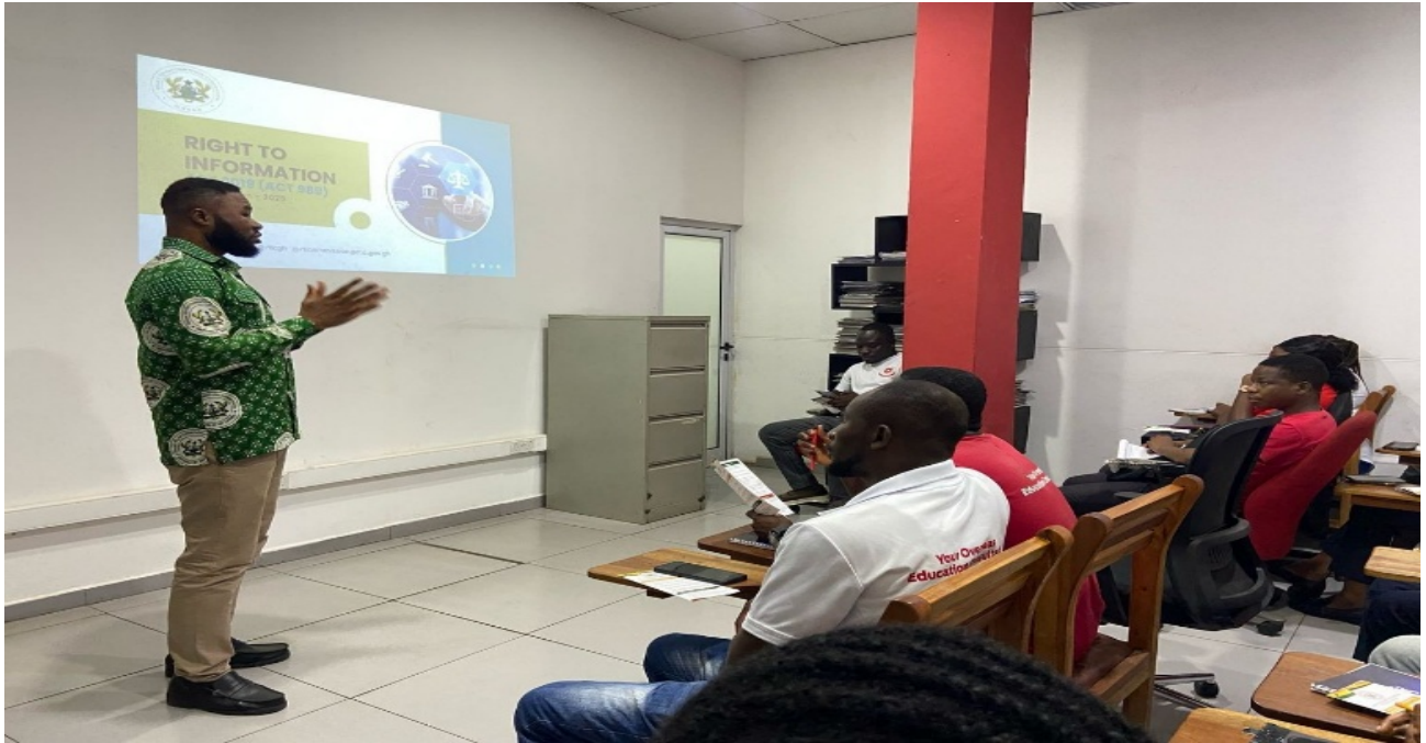
RTI COMMISSION INTENSIFY SENSITIZATION EFFORTS IN THE ASHANTI REGION

contributed to the effective resolution of disputes, thereby strengthening the enforcement mandate of the right to information in Ghana.