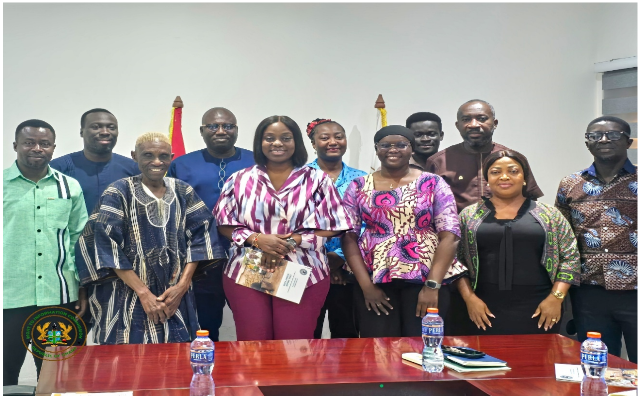
RTI COMMISSION STRENGTHENS COLLABORATION WITH GDCA