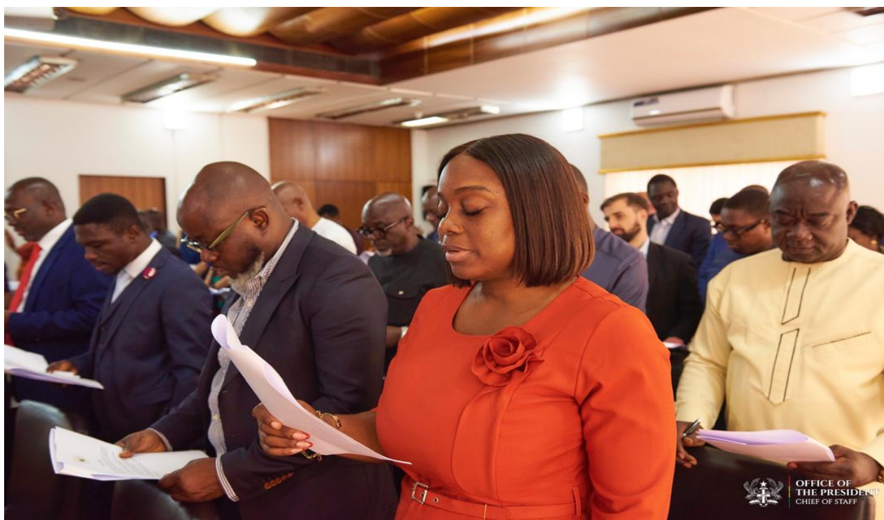
RTIC'S EXECUTIVE SECRETARY SWORN IN AS PART OF GHANA'S NATIONAL ANTI-CORRUPTION WORKING GROUP