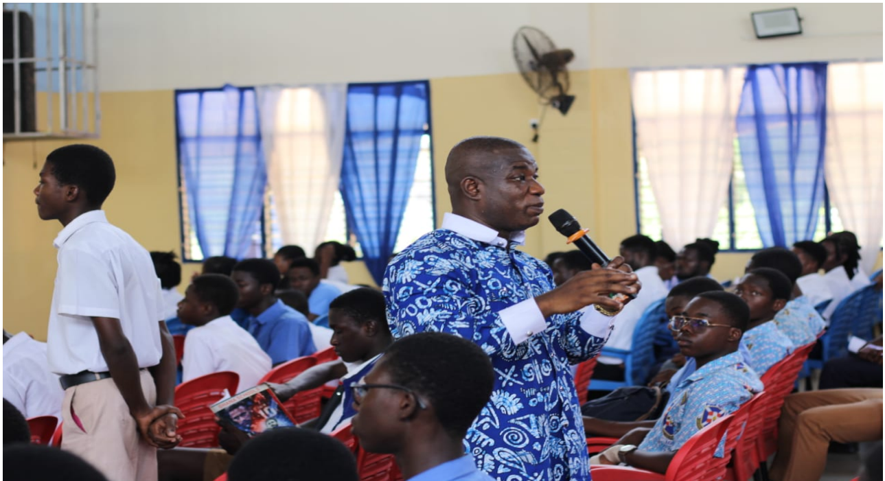
RTIC EDUCATES THE PUBLIC AT A COMMUNITY LEGAL CLINIC SERIES