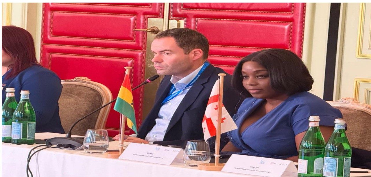
RTIC PARTICIPATES IN THE INTERNATIONAL CONFERENCE OF INFORMATION COMMISSIONERS