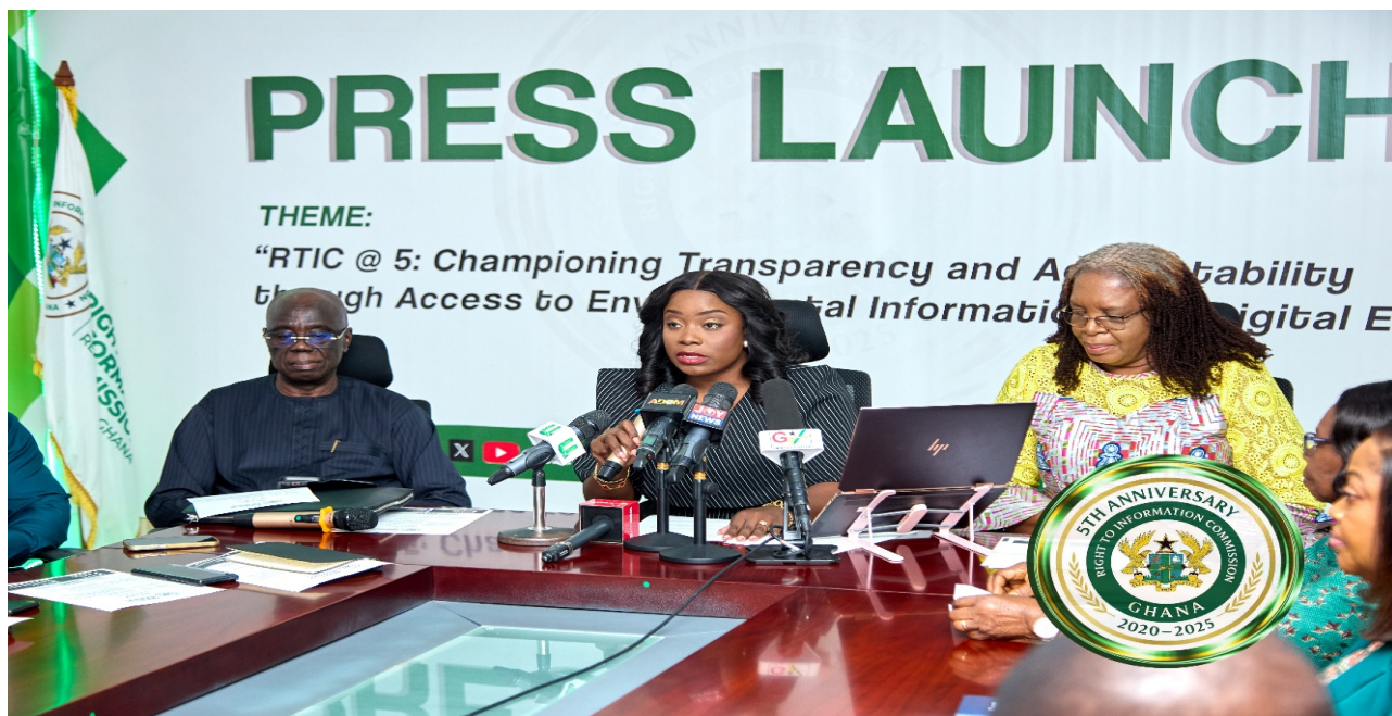
RTIC LAUNCHES 5 TH ANNIVERSARY OF PROMOTING TRANSPARENCY AT A PRESS CONFERENCE