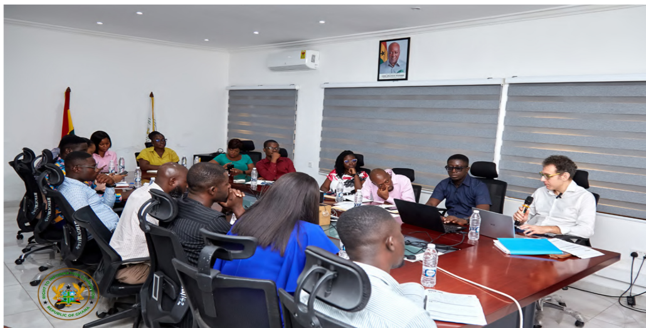
RTIC STAFF UNDERGOING TRAINING ON THE IMPLEMENTATION ASSESSMENT METHODOLOGY BY A REPRESENTATIVE OF THE CENTRE FOR LAW AND DEMOCRACY