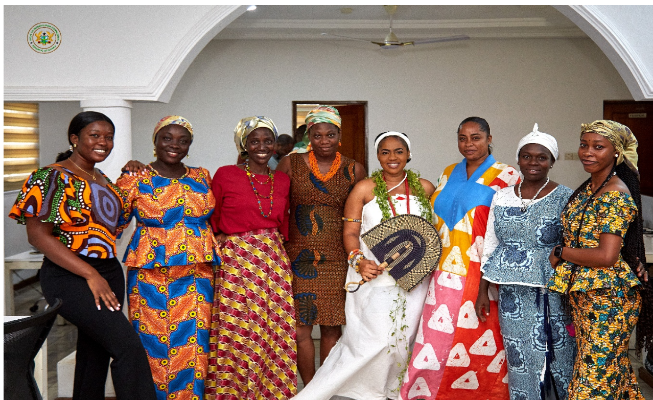
STAFF OF RTI COMMISSION IN TRADITIONAL WEAR MARKING GHANA MONTH IN MARCH 2025