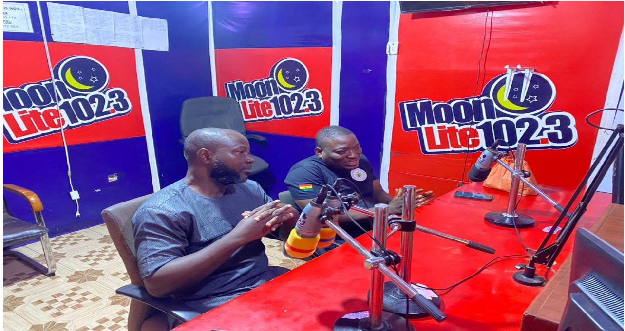
RTI COMMISSION SENSITIZATION INITIATIVES IN THE BONO REGION