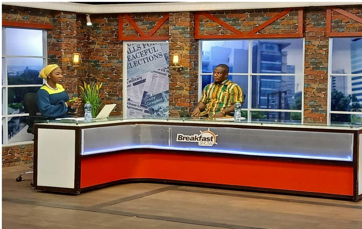
HEAD OF LEGAL OF THE RTI COMMISSION, STEPHEN OWUSU (RIGHT) ON GHANA TELEVISION'S (GTV) BREAKFAST SHOW