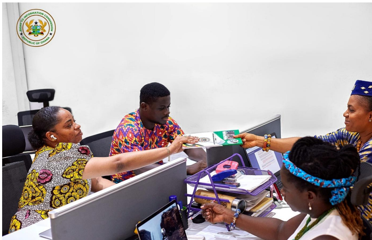
STAFF OF RTI COMMISSION IN GHANA-MADE WEARS MARKING THE 2024 HERITAGE MONTH (MARCH) OF GHANA