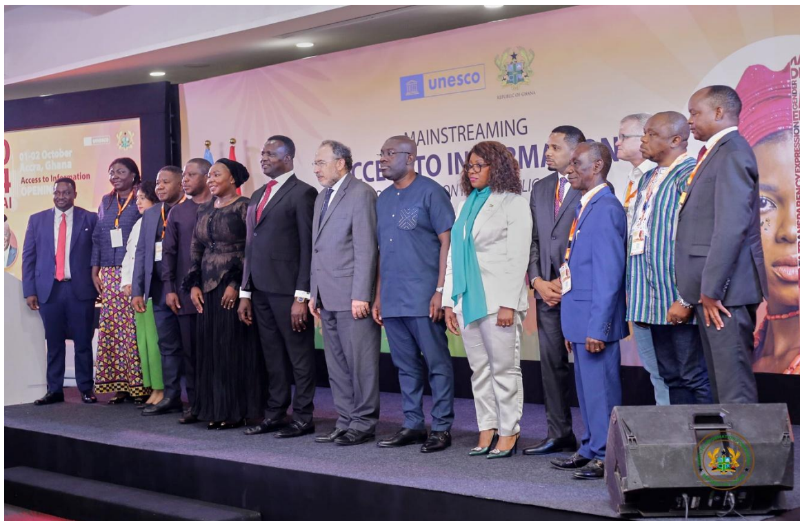
THE EXECUTIVE SECRETARY OF THE RTI COMMISSION, YAW SARPONG BOATENG ESQ (1 ST FROM LEFT), THE INFORMATION MINISTER OF GHANA, HON. FATIMATU ABUBAKAR (6 TH LEFT), THE MINISTER OF EDUCATION AND THE REPRESENTATIVE OF THE PRESIDENT OF GHANA, HON. DR. YAW OSEI ADUTWUM (7 TH LEFT), JUSTICE (RTD) K.A. OFORI ATTA WITH SOME OTHER DIGNITARIES AT THE 2024 INTERNATIONAL