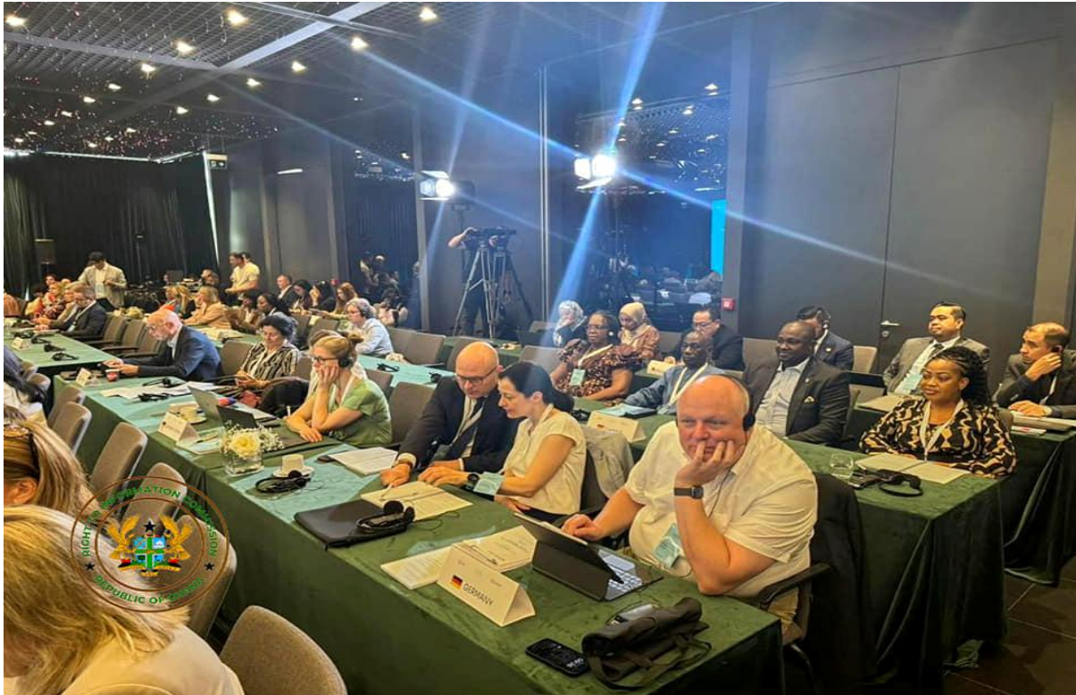
RTI COMMISSION DELEGATION AT THE 2024 INTERNATIONAL CONFERENCE OF INFORMATION COMMISSIONERS AT ALBANIA