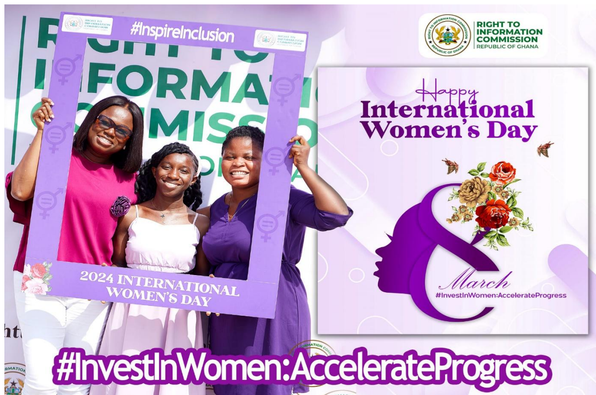
RIGHT TO INFORMATION COMMISSION COMMEMORATING THE 2024 INTERNATIONAL WOMEN'S DAY