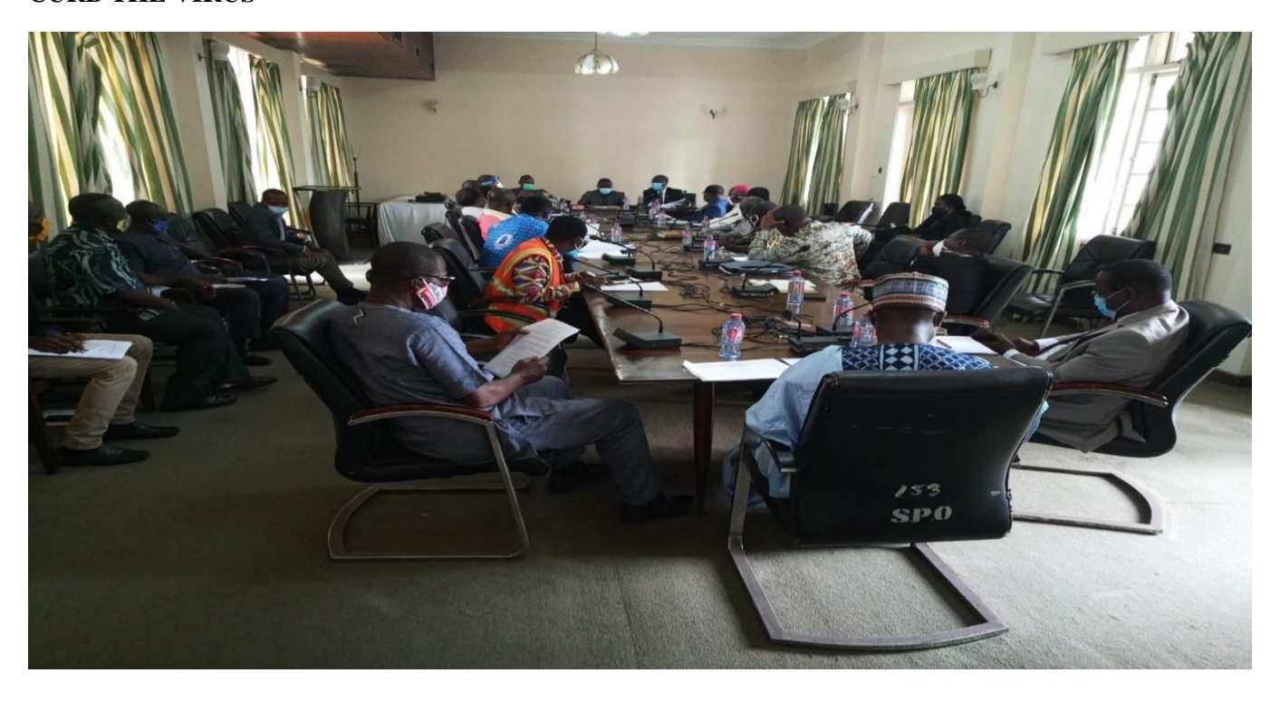
MEETING BETWEEN COVID-19 TEAM, RELIGIOUS LEADERS AND THE MINISTRY OF CHIEFTAINCY AND RELIGIOUS AFFAIRS

MEETING BETWEEN COVID-19 TEAM, ZOOMLION, RELIGIOUS LEADERS AND THE MINISTRY OF CHIEFTAINCY AND RELIGIOUS AFFAIRS DISCUSSING MODALITIES TO CURB THE VIRUS