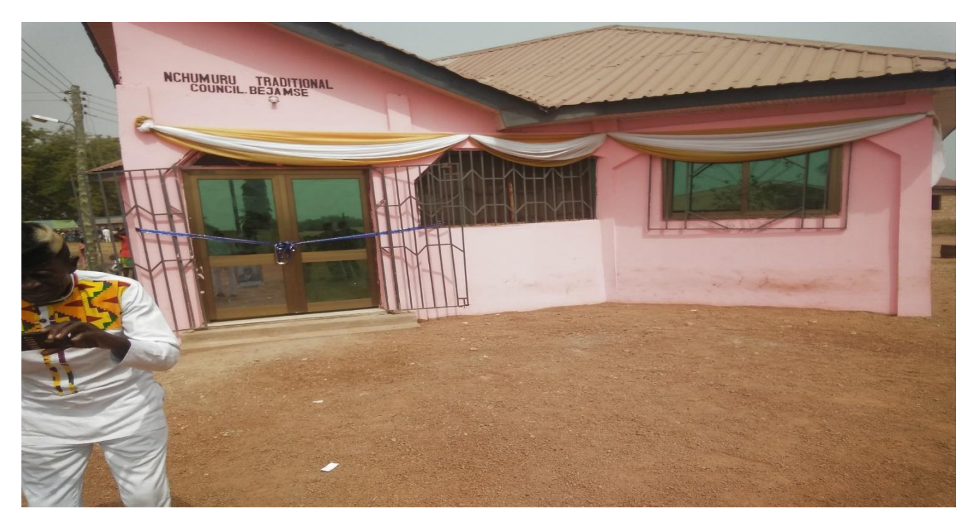
A SPEECH DELIVERED BY HON. KOFI DZAMESI DURING INAUGURATION CEREMONY OF NCHUMURU TRADITIONAL COUNCIL IN BEJAMSE