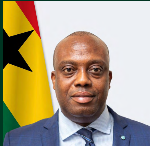
Hon. Thomas Ampam Nyarko Deputy Minister for Finance and MP for Asuogyaman