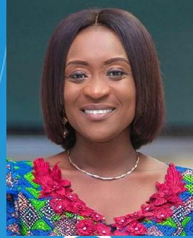
Hon. Abena Osei Asare Deputy Minister for Finance (MP)