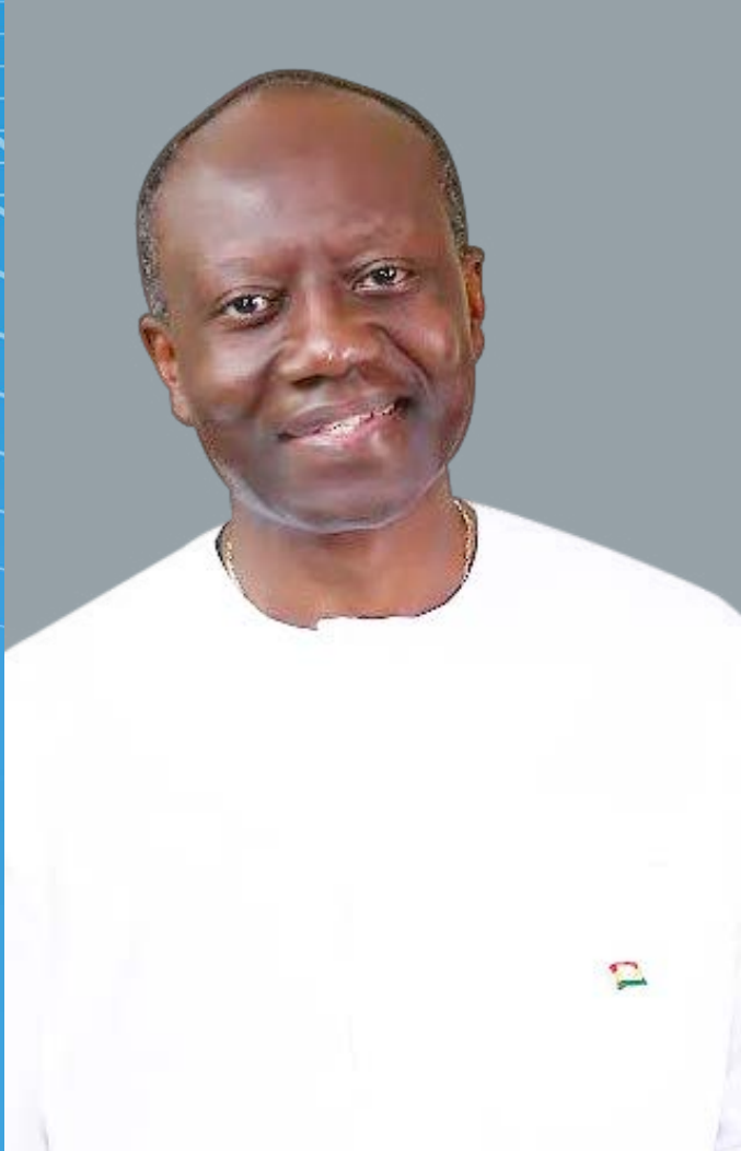
Hon. Ken Ofori-Atta Minister for Finance