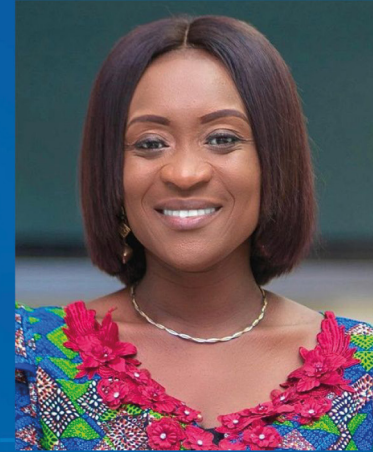
Hon. Abena Osei Asare Deputy Minister for Finance (MP)