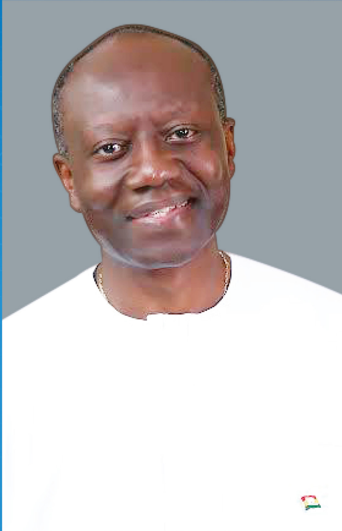
Hon. Ken Ofori-Atta Minister for Finance