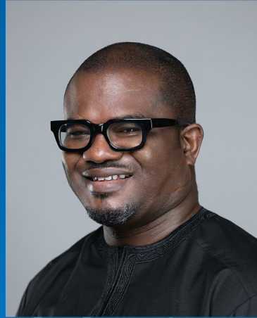
Hon. Charles Adu Boahen Minister of State, Finance