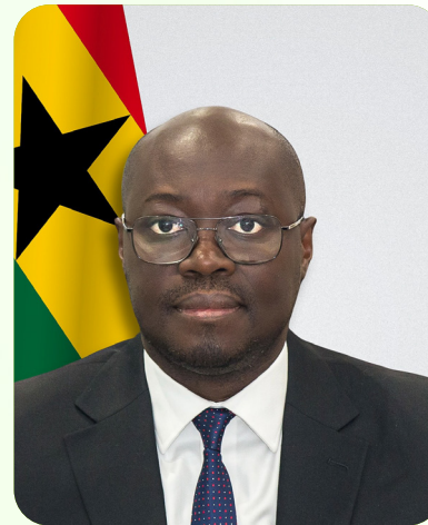
Hon. Dr. Cassiel Ato Baah Forson Minister for Finance

Additionally, the Finance Minister and Deputy publicly filed their tax returns to promote tax compliance, while Government continued mobilising transparent support for the Black Stars' participation in the 2026 FIFA World Cup.