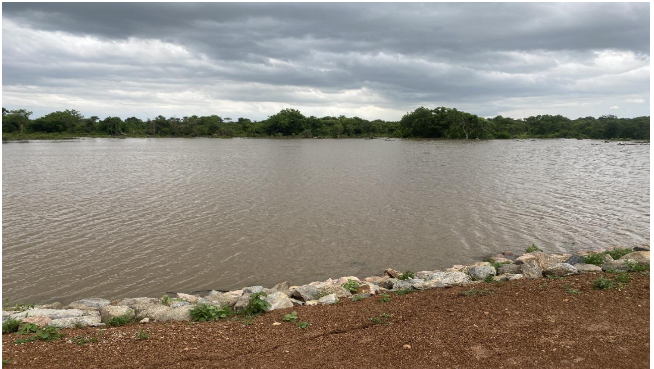
Irrigation Dams at Kojokperi