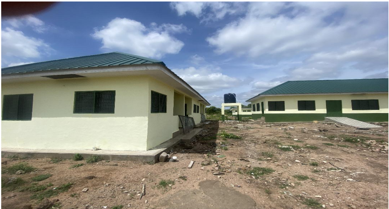
CHPS Compound with 3 unit nurses accommodation at Kenkelle