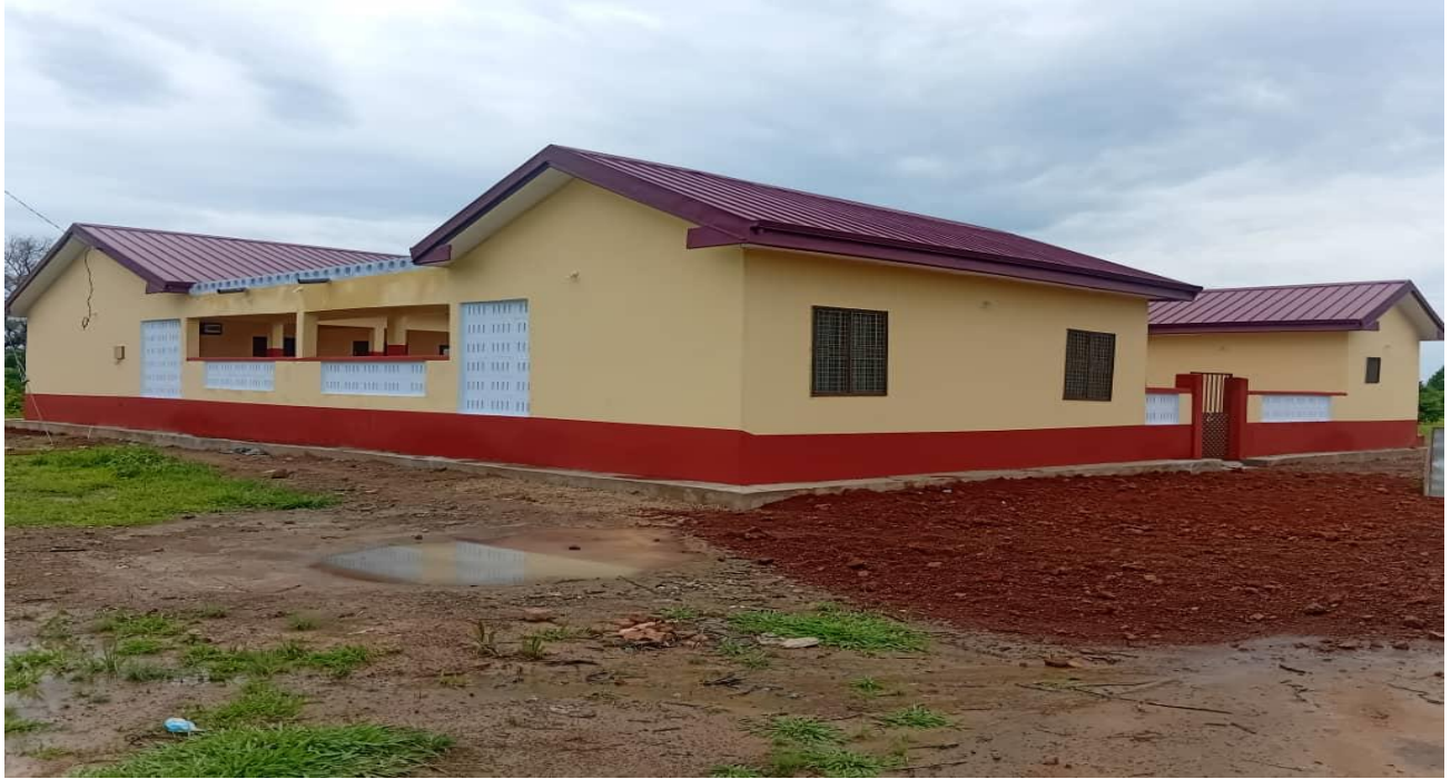
KG Block at Bussie-Dobabiiri