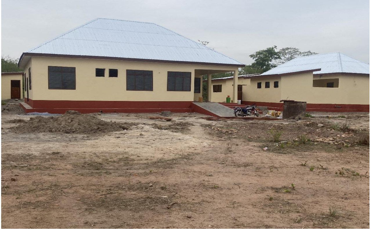
CHPS Compound and Nurses Quarters at Daffiama-Moyiri