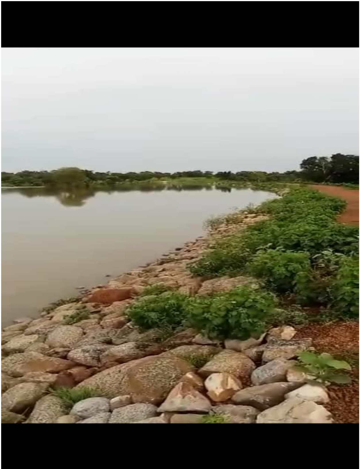
Irrigation Dams at Tabiase