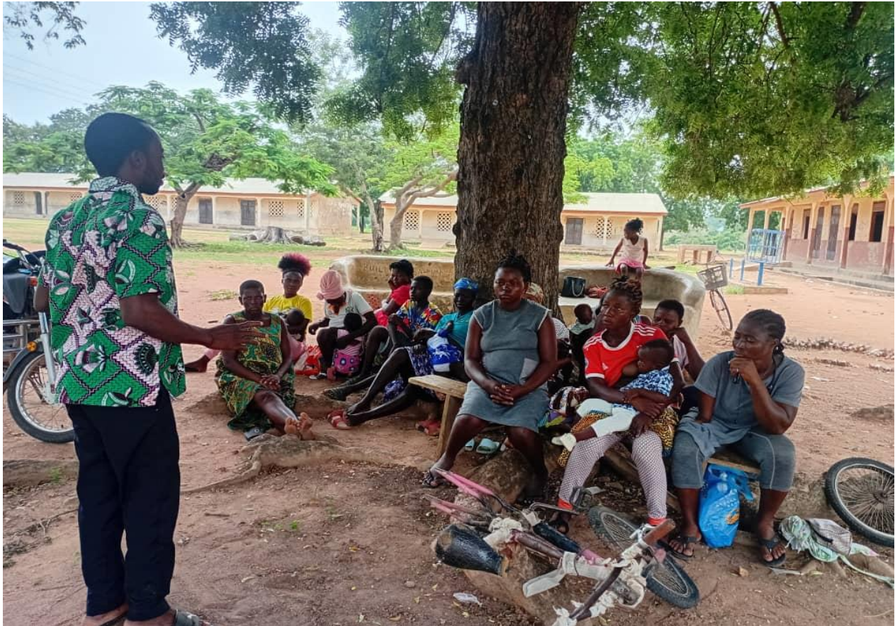
Demonstration of improved agricultural technologies to farmers at Beo