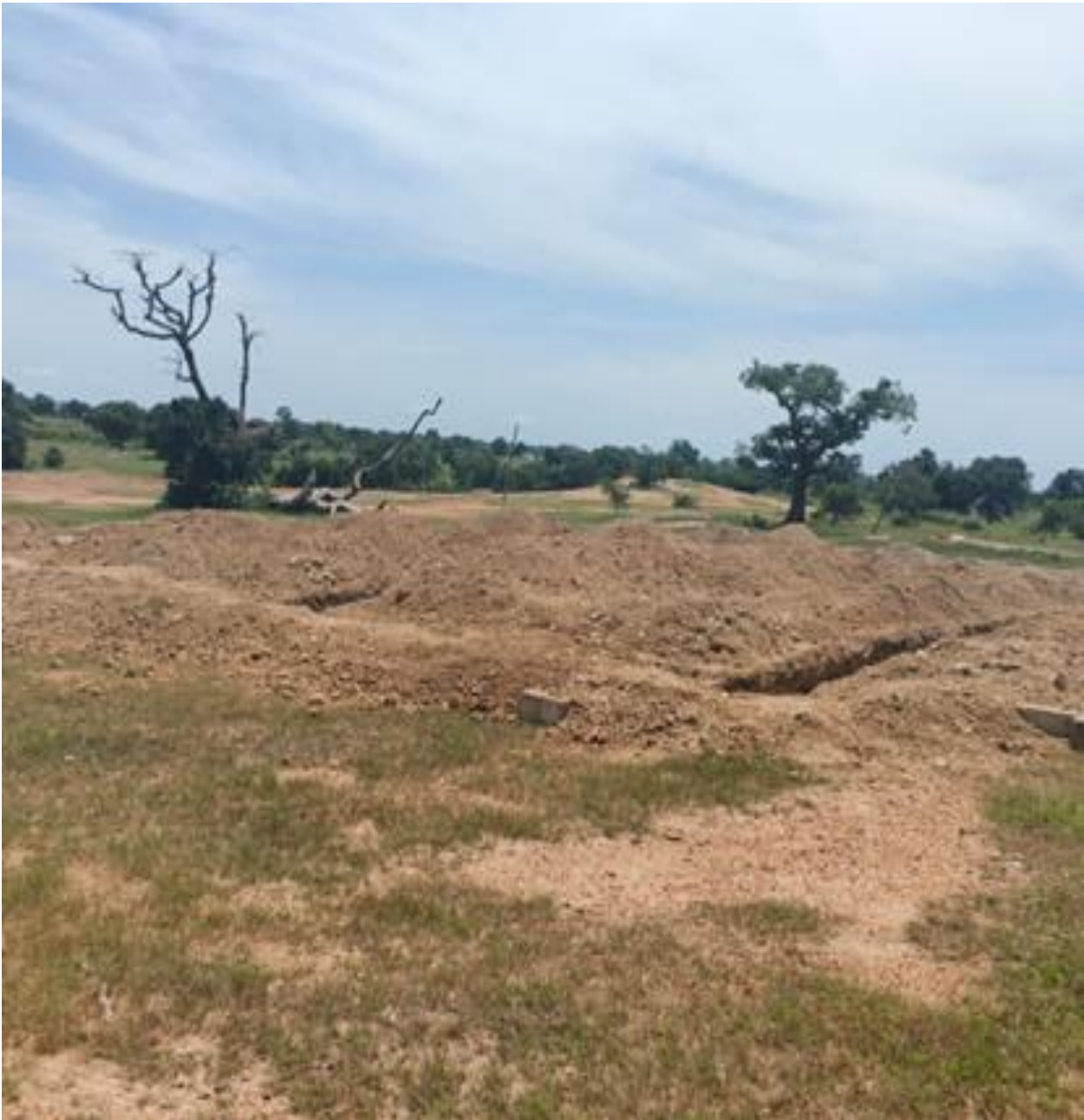
Commenced the Construction and furnishing of 1 No. KG Block with office and store at Adaboya

Some of the pictures (projects and programmes) are further shown below.