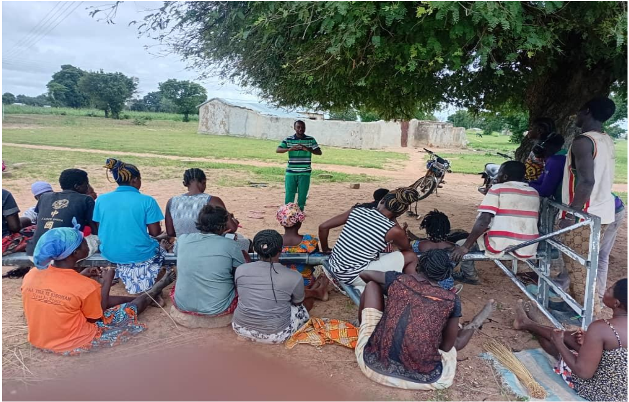
Delivery of Extension Services to Farmers at Namoo