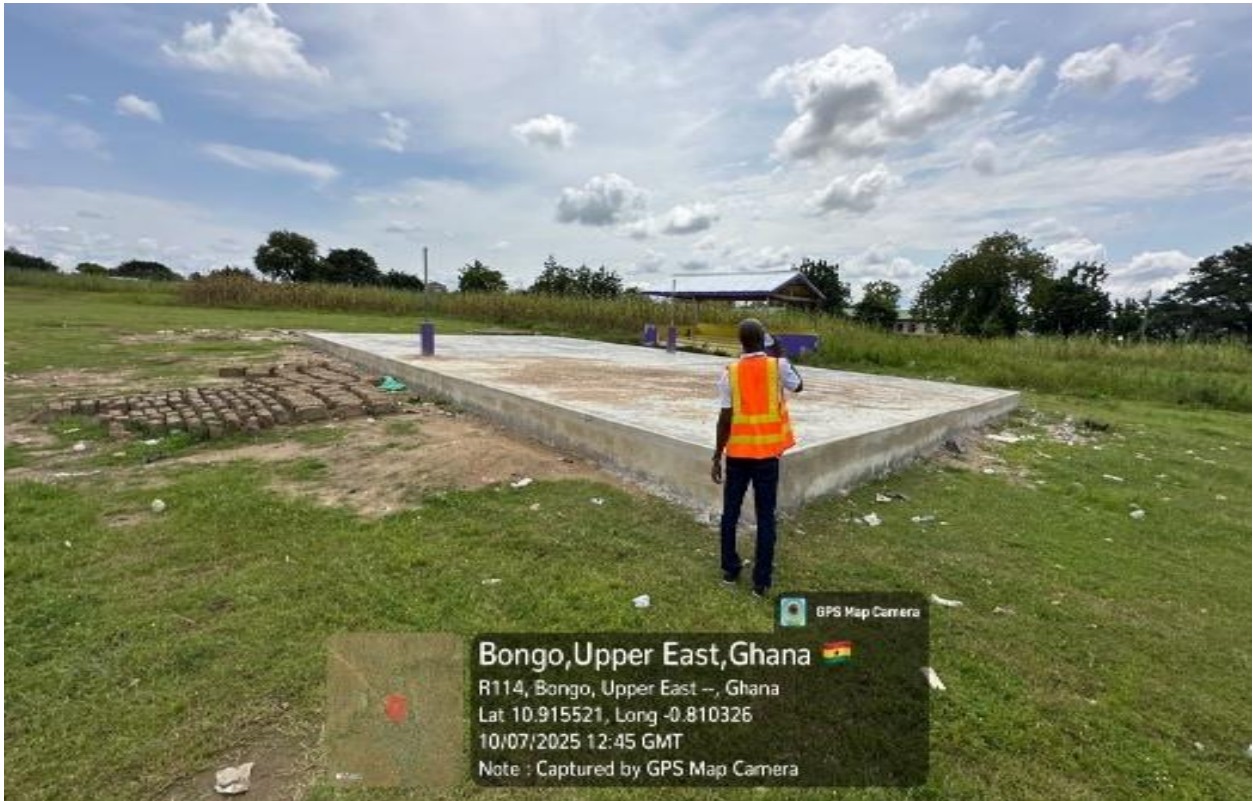
Construction of 1No. Volleyball Court at Bongo