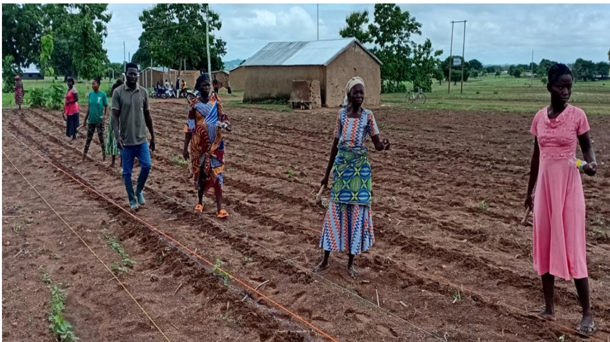
Delivery of Extension Services to Farmers at Zorkor