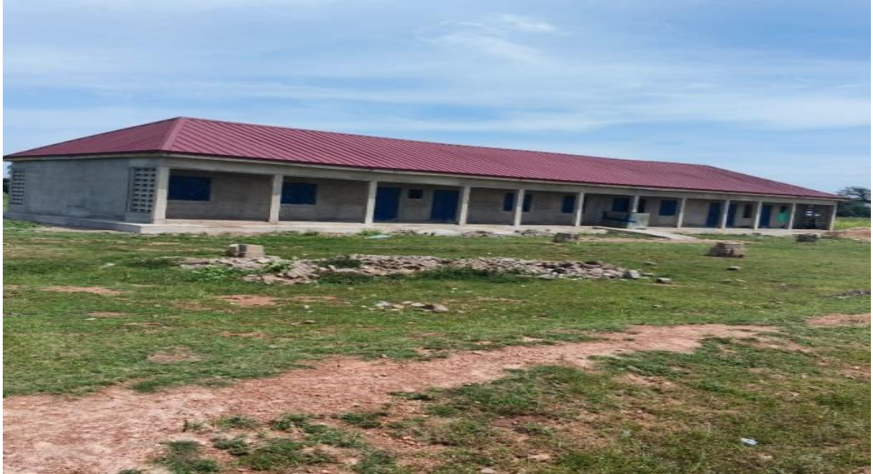
Construction of 1No. 3-Unit classroom Block with ancillary facilities at Lembisi