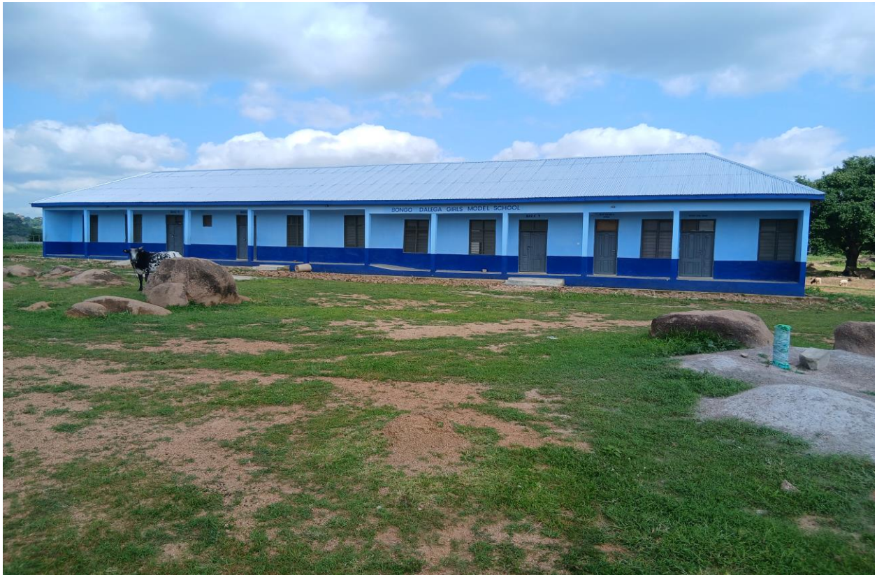
Construction of 3-Unit classroom Block with ancillary Facilities at Daliga