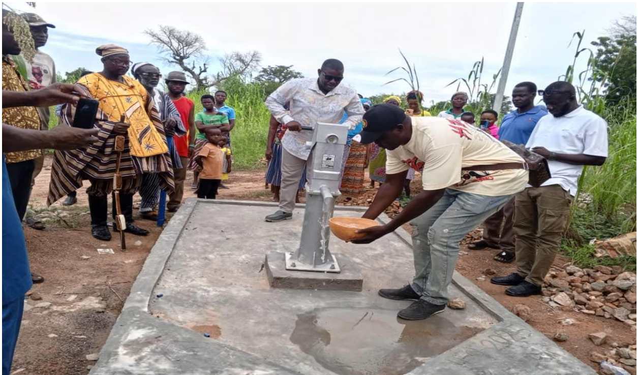
Drilled, tested and installed 2No. Boreholes at Gorigo and Borigo