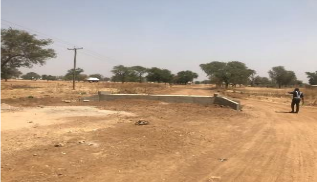
Rehabilitation of Tingre - Akuyeligo feeder road (5.0km)