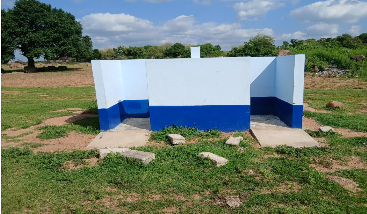
Construction Urinal at Daliga