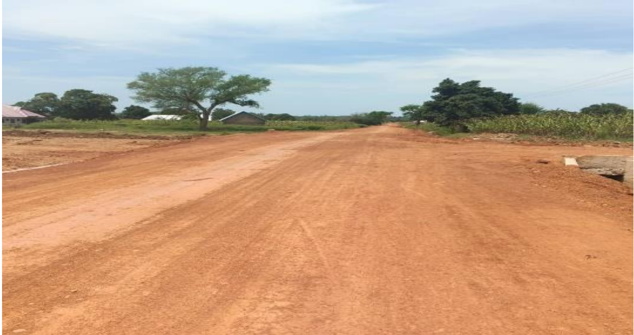
Spot Improvement of Bongo-Tingre Feeder Road (1.0km)