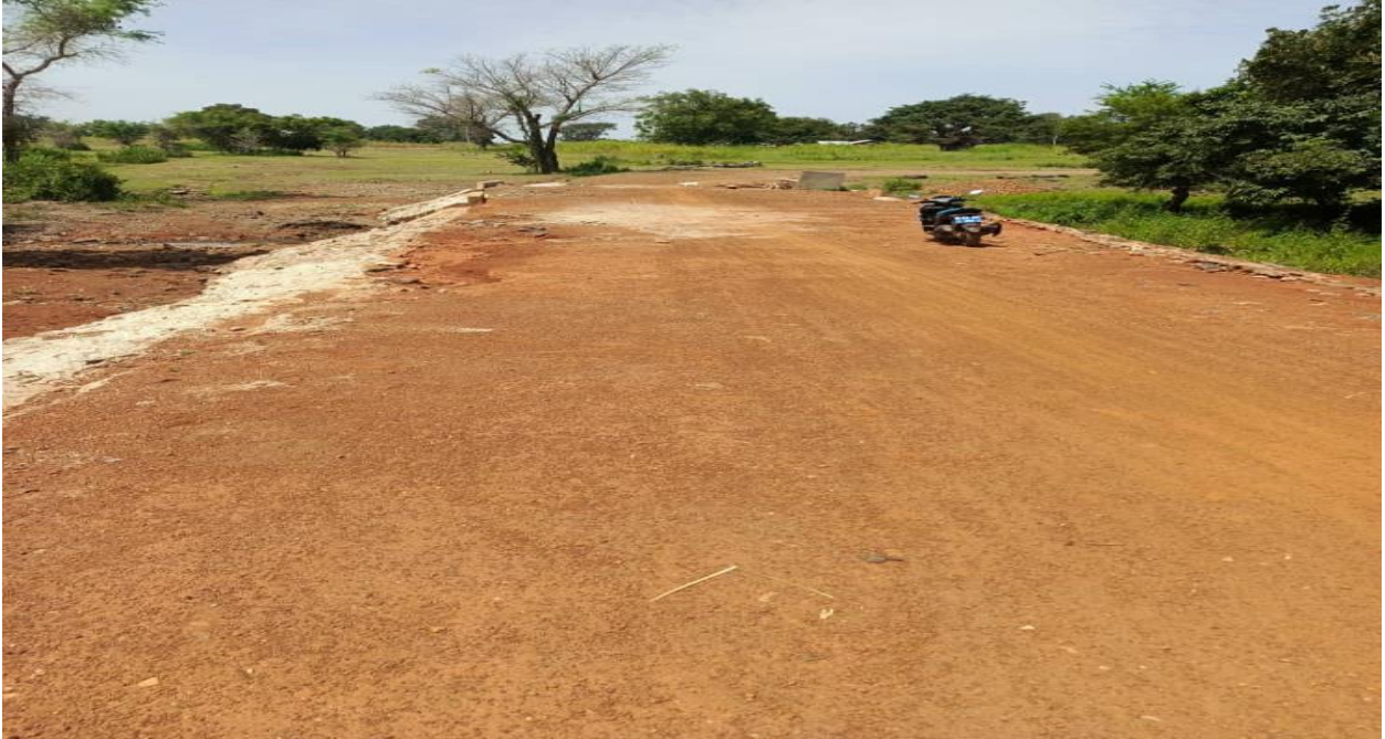
Completed 40% work on Rehabilitation of Sanabiisi-Kabre-Akulyor feeder road (5.0km)