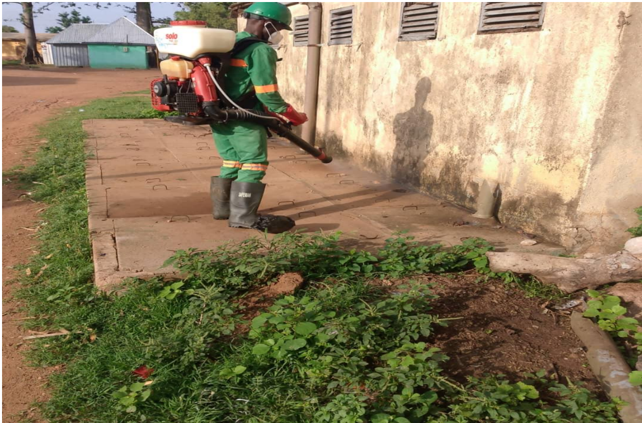
Fumigation exercise at Balungu and Gowrie public toilets