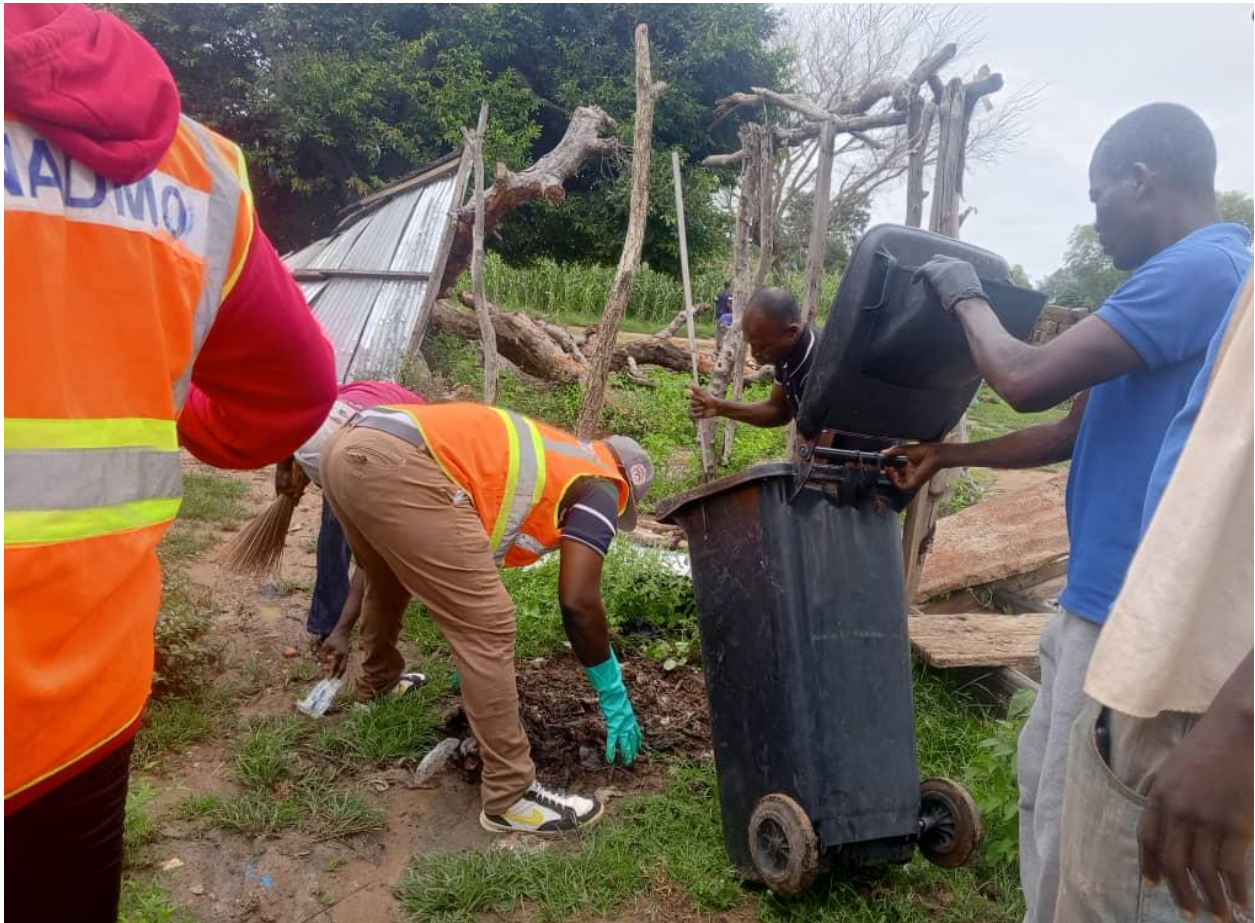
National Sanitation day clean-up exercise at Bongo-Soe, 6 th September, 2025