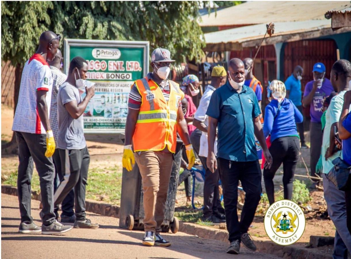
National Sanitation day clean-up exercise at Bongo, 4 th October, 2025