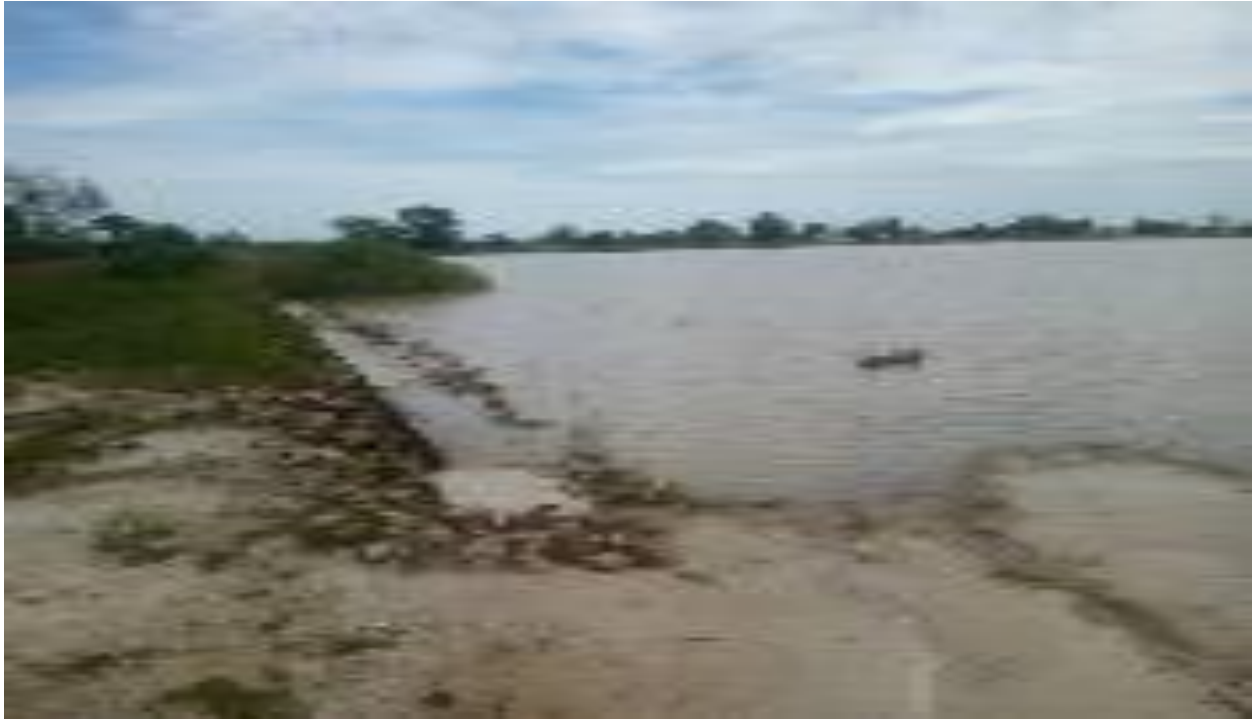
Rehabilitation of Small Earth Dam at Bungu/ Kansoe