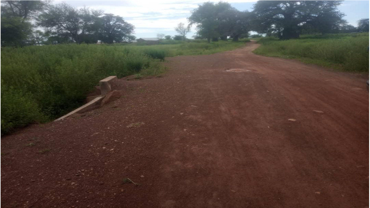
Construction of a Culvert at Namoo-Kansoe