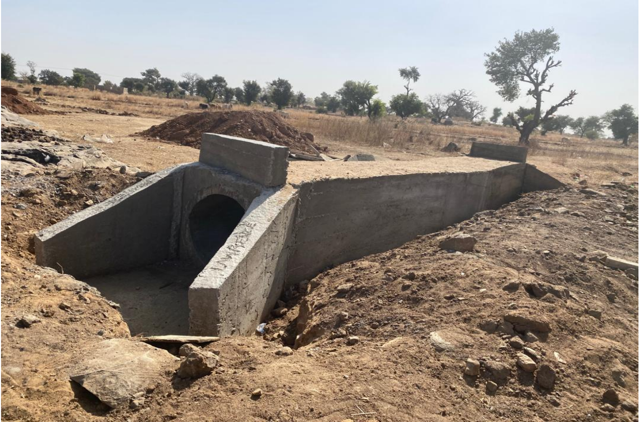
Construction of 1No. 1800mm diameter pipe culvert on Kansoe -Namoo Feeder