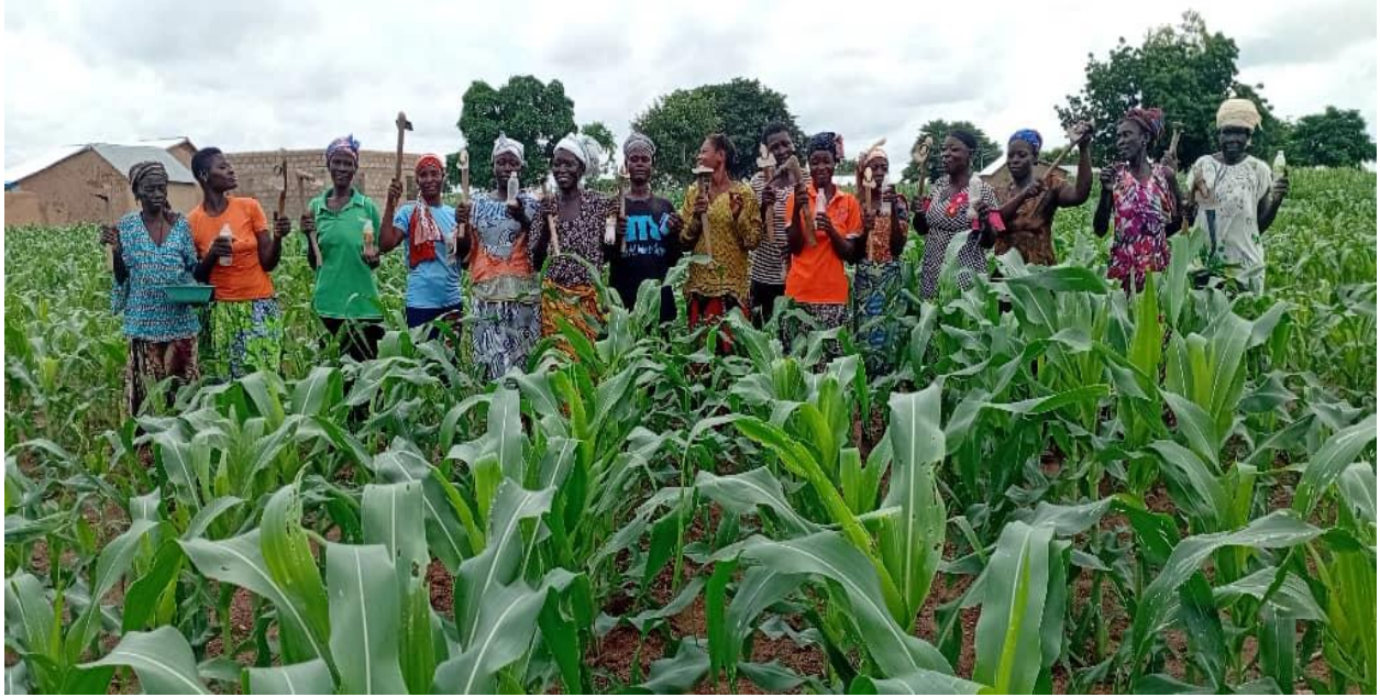
Demonstration of improved agricultural technologies to farmers at Bongo