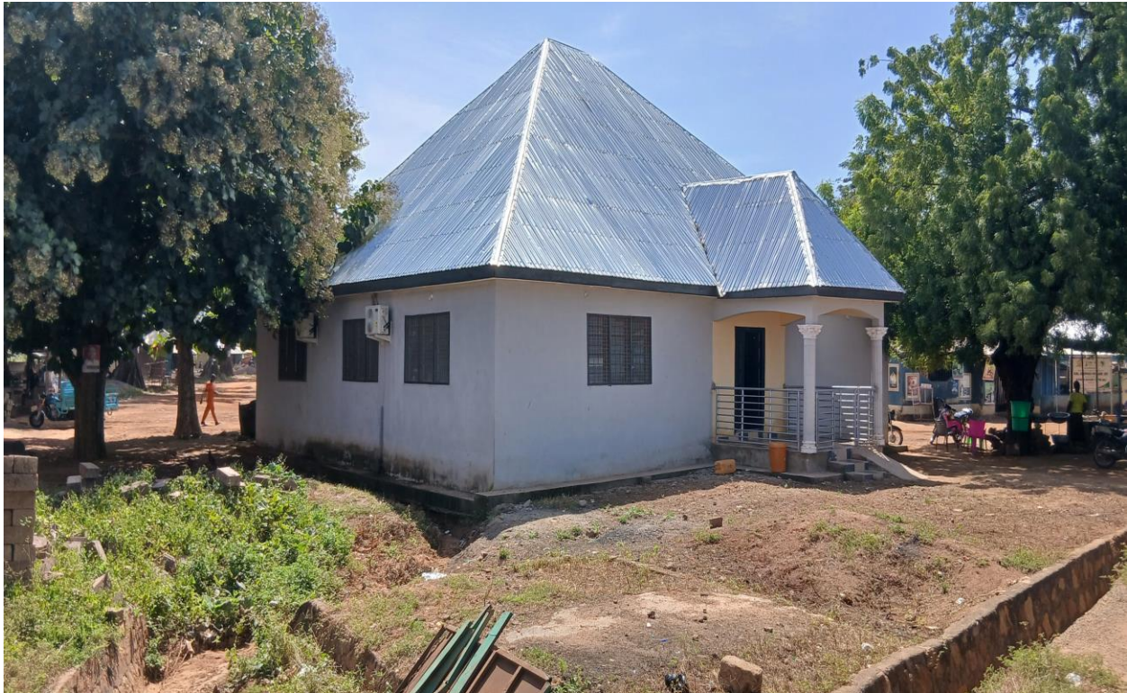
Completion and Furnishing of Business Skills Training Centre for Livelihood Groups at Bongo