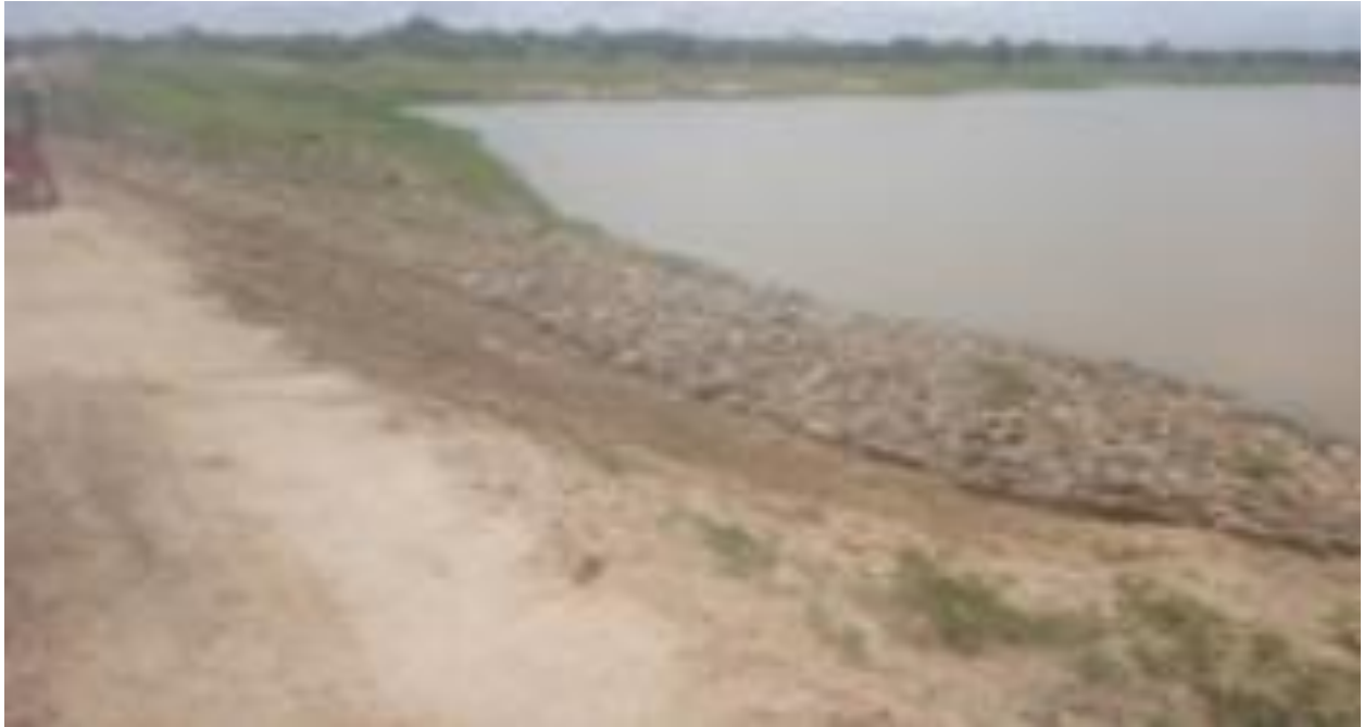
Rehabilitation of Small Earth Dam at Gorigo