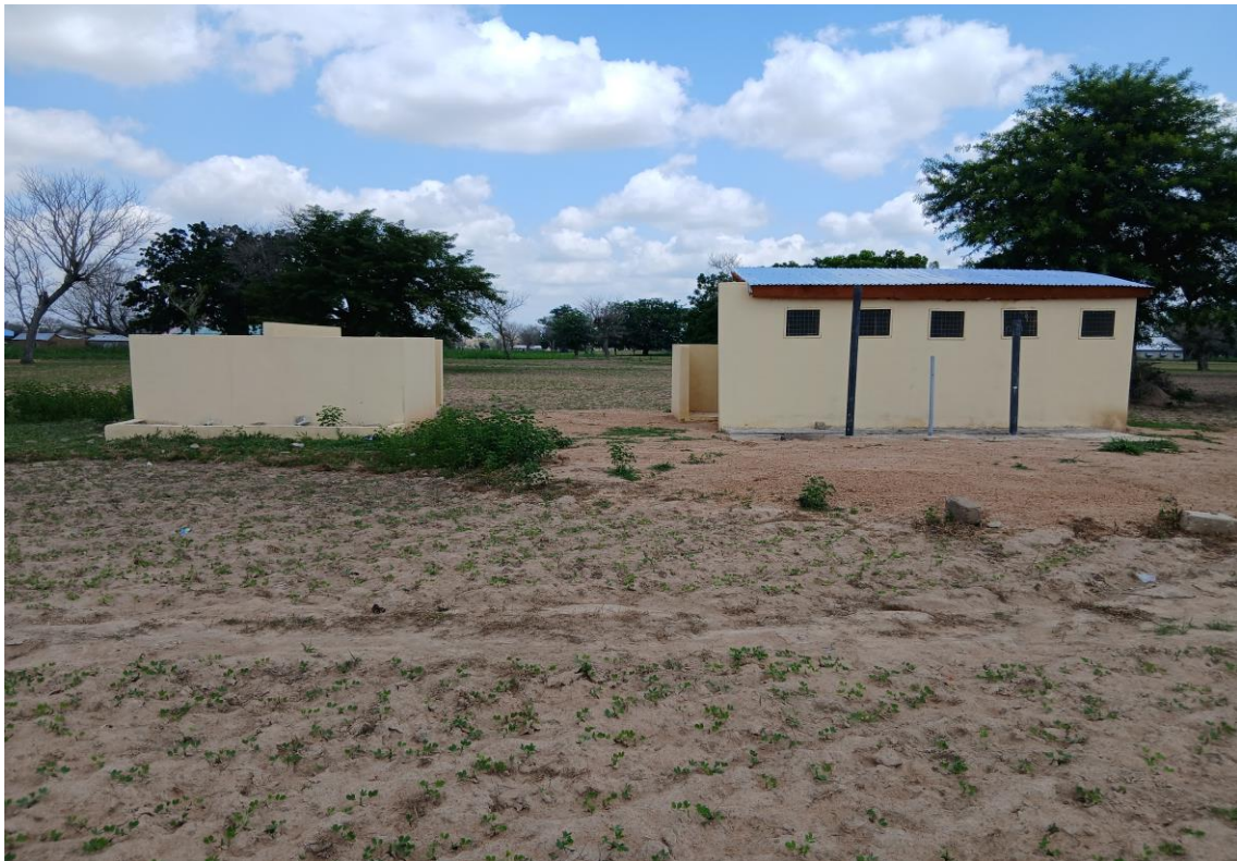
Construction of 1No. 3-Unit classroom Block with ancillary facilities at Zorkor Kanga