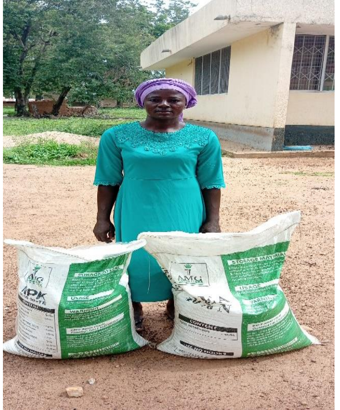
Distribution of Fertilizer to Farmers in Bongo