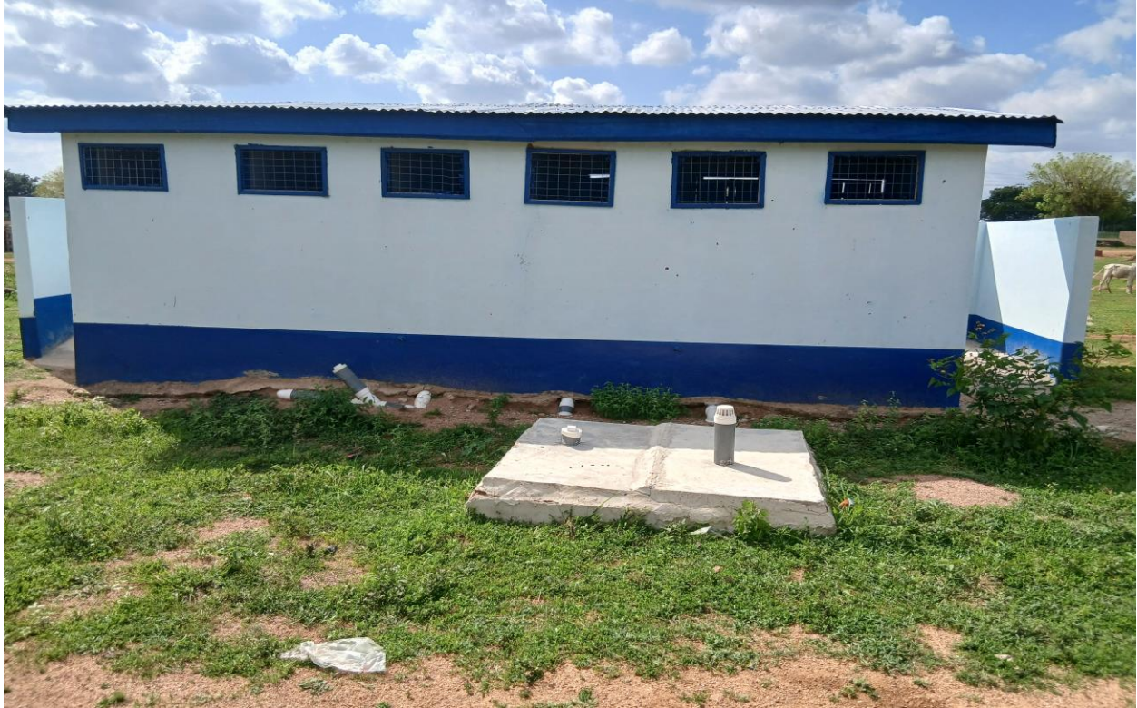
Construction of Toilet Facility at Daliga