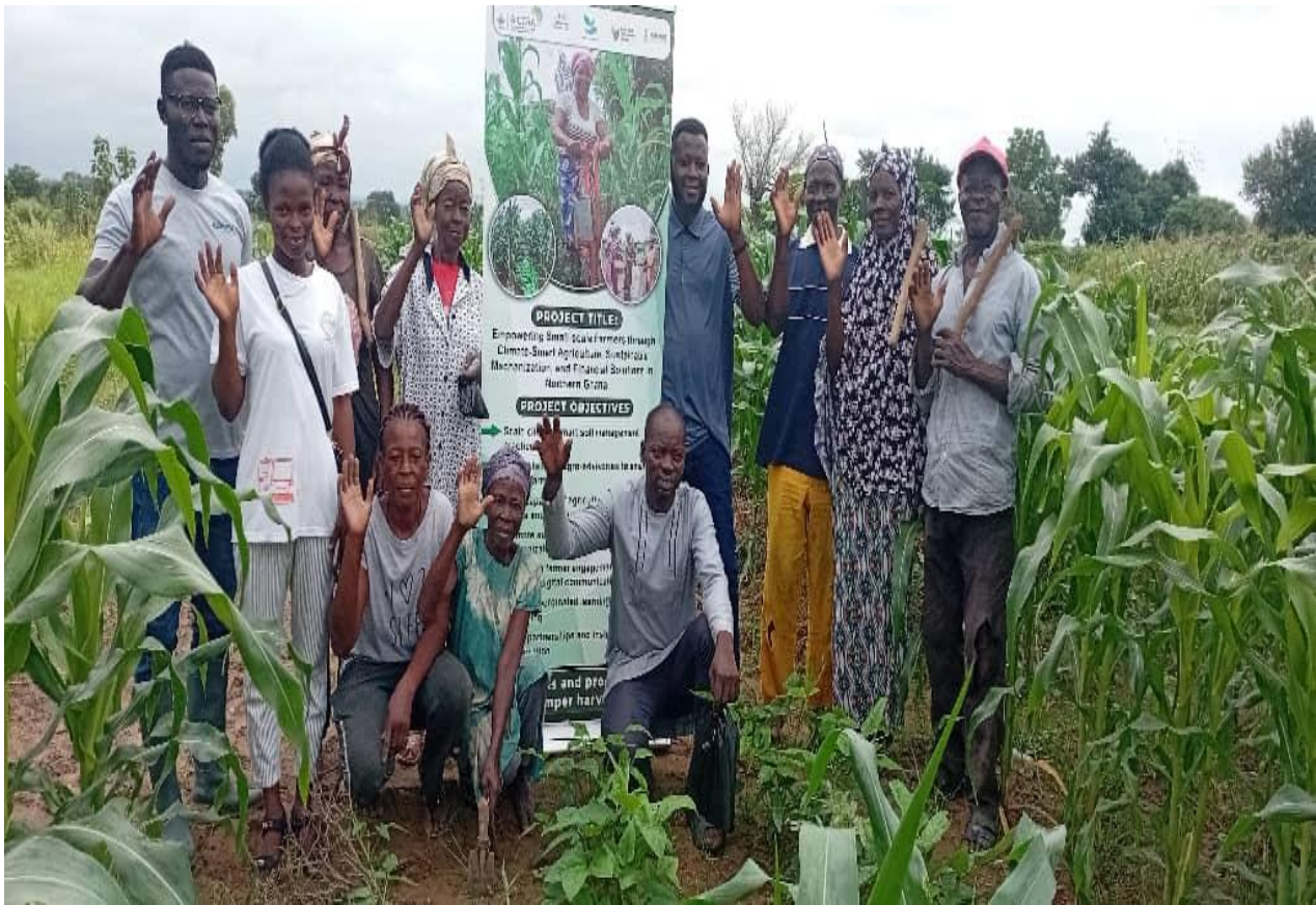
Demonstration on climate-resilient agricultural technologies to farmers at Beo