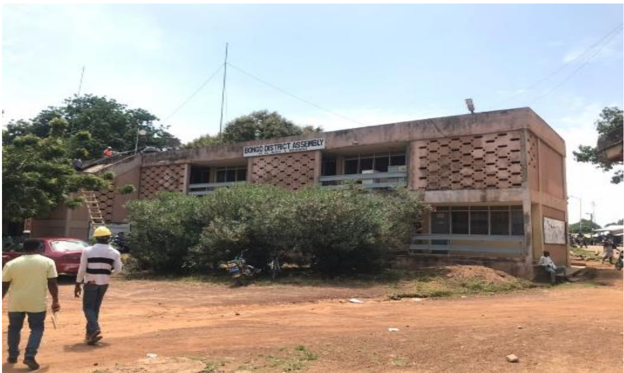
Commenced work on the Renovation of Assembly Administration Block A