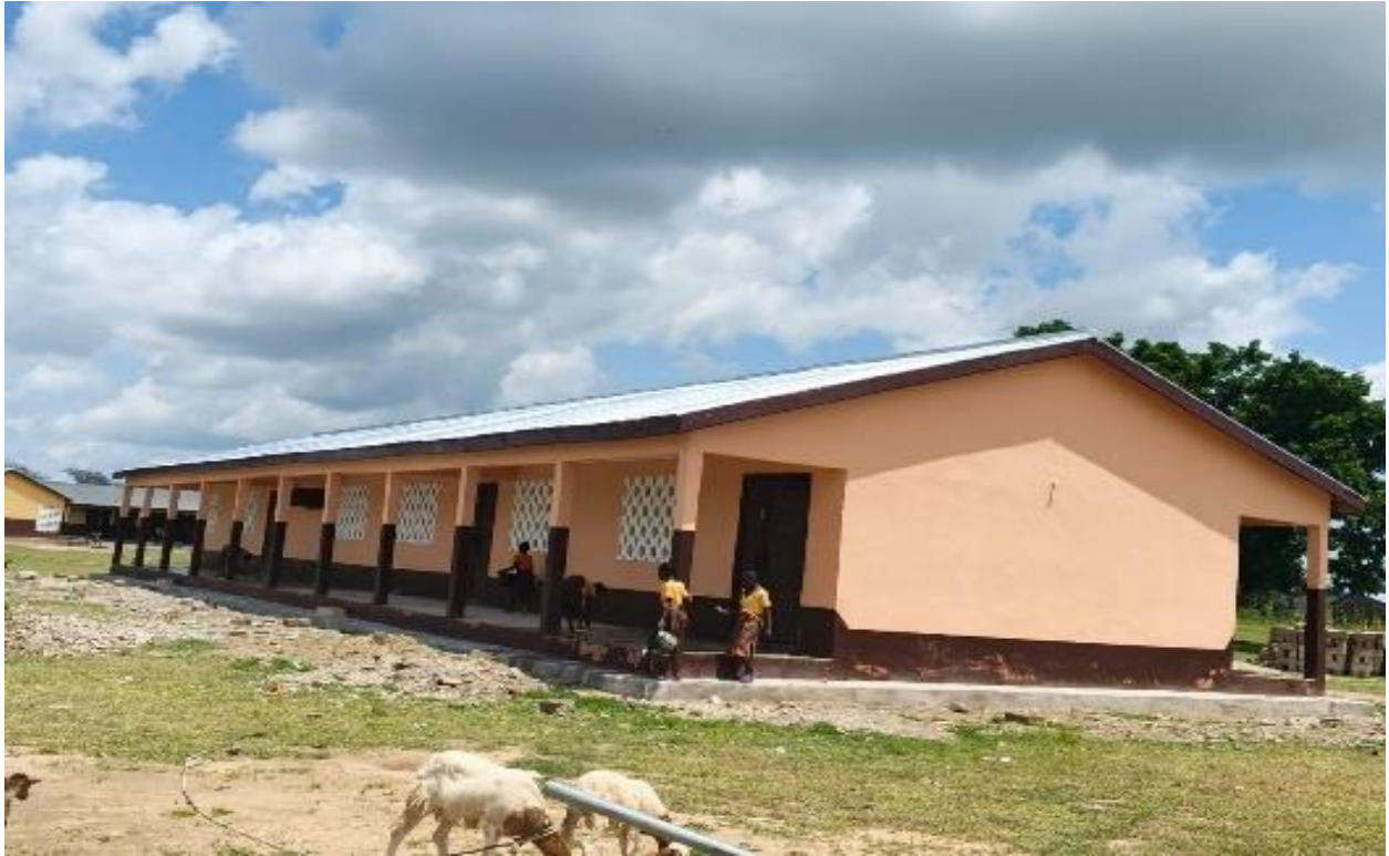
Renovation of 1No. 3-Unit classroom Block with ancillary facilities at Asakulisi