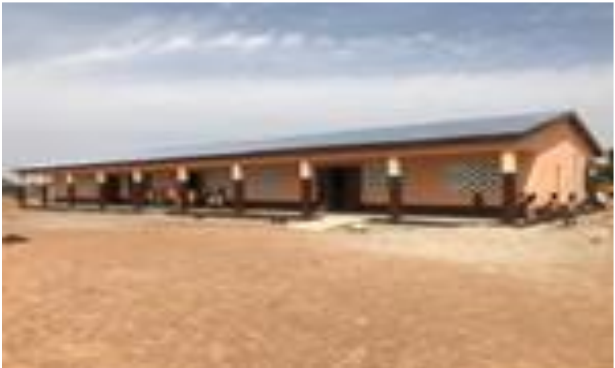
Renovation of 1No. 3-Unit classroom Block with ancillary facilities at Nayorogo