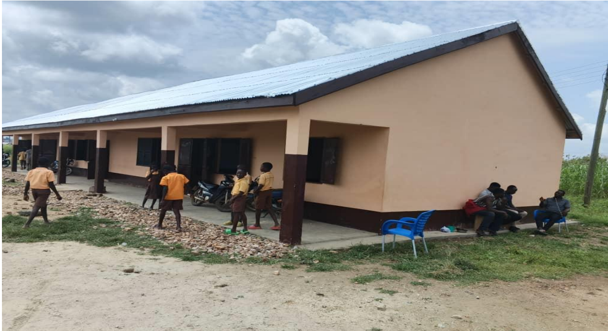
Completion of 1No. 3-Unit classroom Block with ancillary facilities at Dua Yikene