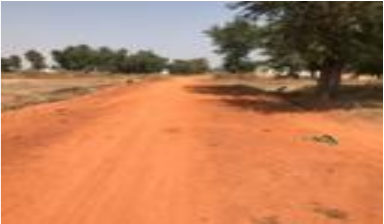
Completed 40% work on Rehabilitation of Akuyeligo- Tingre - Wegurigo feeder road (5.0km)