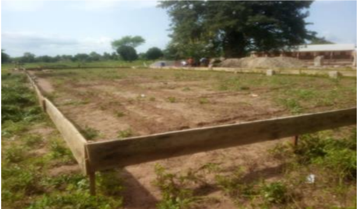
Commenced Construction and furnishing of 1 No. 3 Unit classroom at Namoo-Donne