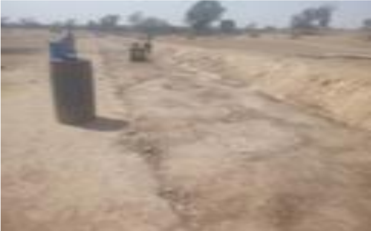
Rehabilitation of Small Earth Dam at Sambolgo-Moo