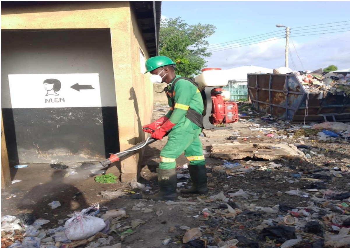
Fumigation exercise at Bongo Hospital and Market