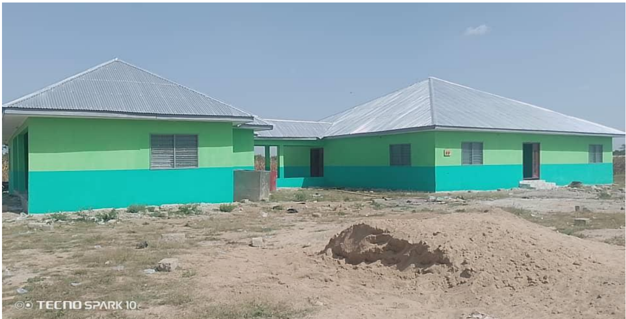
Construction of 1No. CHPS Compound And Supply of 5No. Office Tables, 10No. Office Chairs, 8No. Benches, 2No. Hospital Beds, 2No. Mattresses, 1No. Digital 42” Television, 3No. Beds for Nurses Quarters, 3No. Mattresses for Nurses Quarters, 3No. Tables And 3No. Chairs For Nurses Quarters at Abelinzanga and Construction of 3No. 8M X 6M Pavilions for Shea Butter Extraction At Beo, Namoo And Zorkor