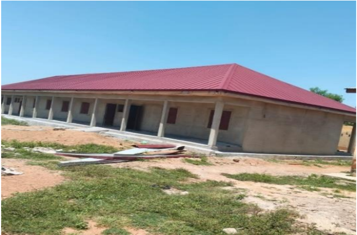
Construction of 1No. 3-Unit classroom Block with ancillary facilities at Kuyelingo