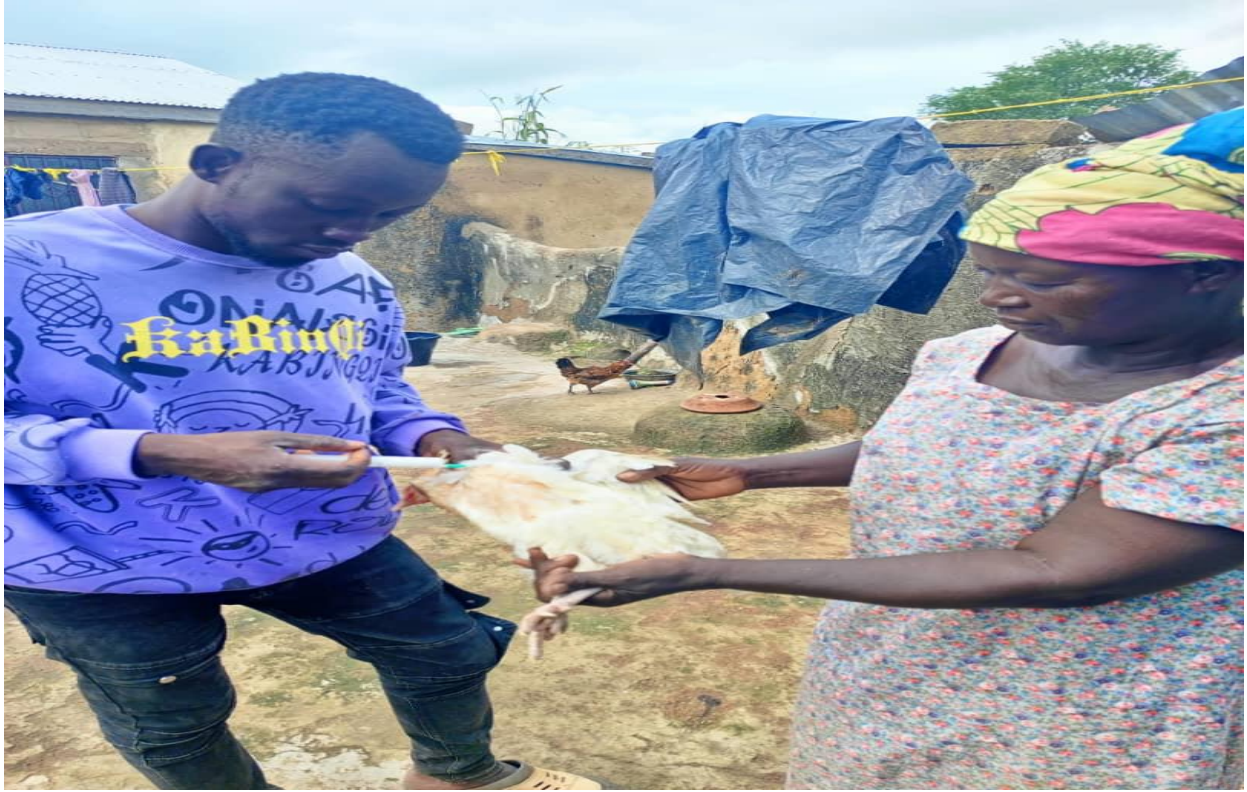
Treatment of poultry birds against new castle disease in Bongo