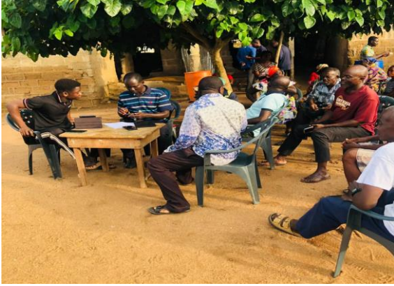
The 149 farmer Based Organization with 2763 Males and 1763 Females of road from Awutu - Breku