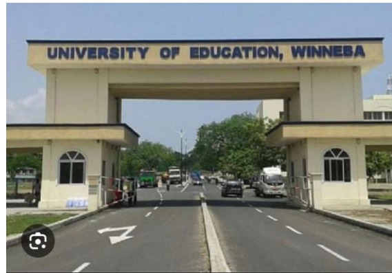
Fifty-Three (53) needy games supported at tertiary level