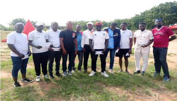
Financial support to all the 8circuits during the inter-circuit but brilliant students at Senya. by the Mp