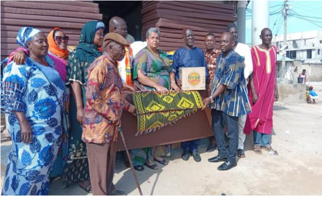
Distribution of relief items to over 200 disaster victims in Awutu Beraku of 40000 cocoa seedlings to cocoa farmers in by the MP. and Nyarkokwaa areas