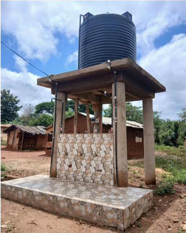
Drilled and mechanized 2No. Boreholes at Watchman and Atronie - IGF