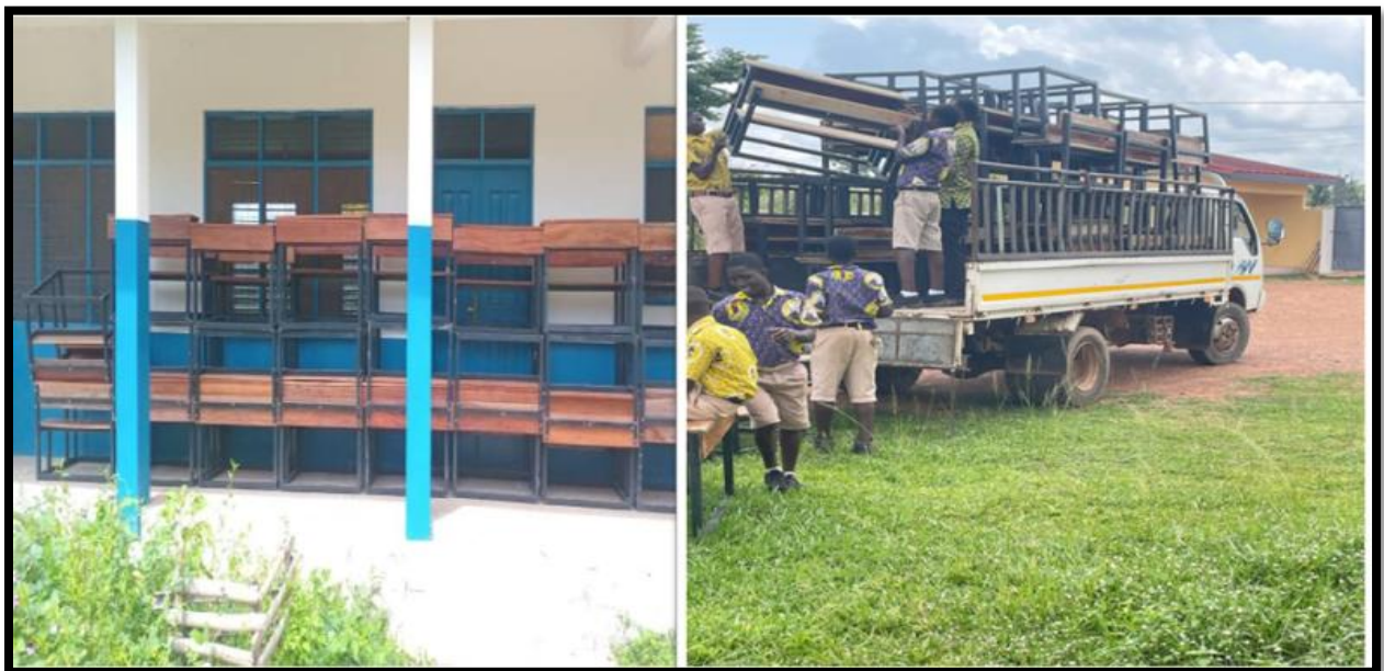
Figure 8: Distributed 140 dual desks Dormaa Akwamu, Akontanim Methodist JHS and Akontanim RC JHS