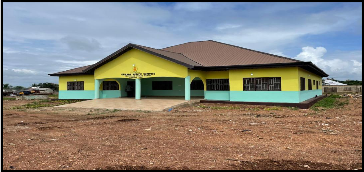
Figure 3: Commissioned and Operationalized 1 No. CHPS compound at Asuotiano (DACF)