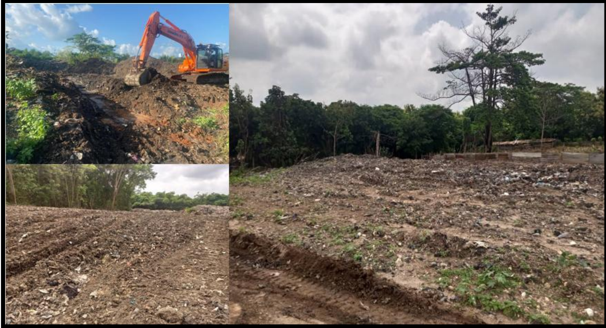
Figure 5: Evacuation Of 2No. Refuse Dumps At Dormaa Akwamu And Wamanafo (DACF)