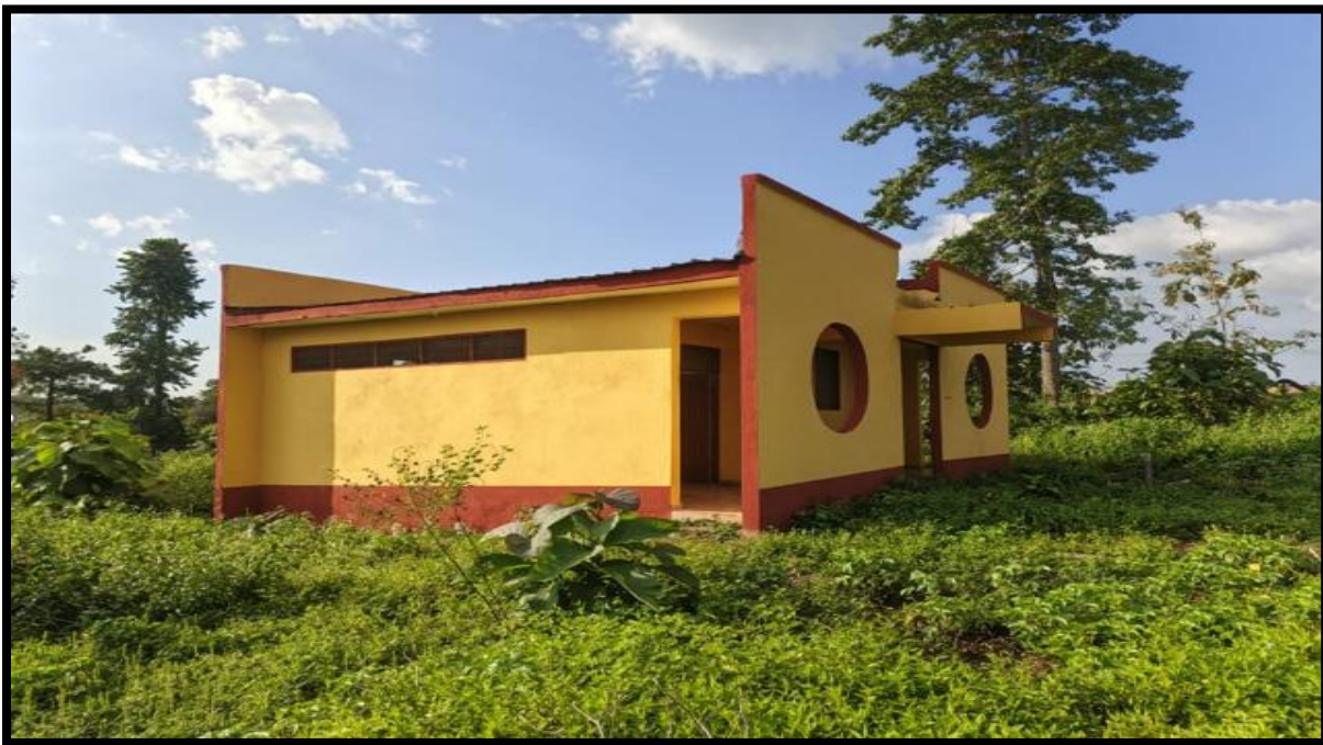
Figure 6: Completed abandoned 10 No. Seater W/C Public Toilet at Akontanim (DACF)