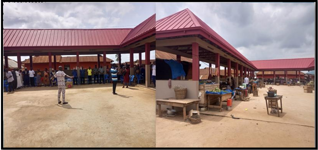
Figure 7: commissioned and operationalized 25 No. open market shed at Kyeremasu (DACF-RFG)