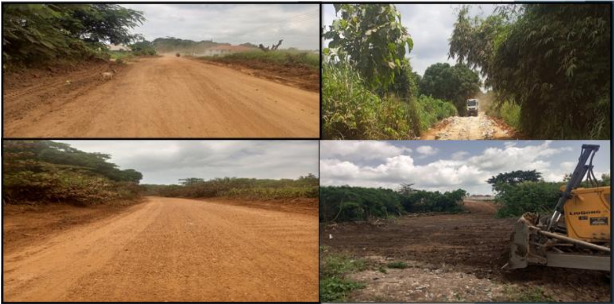
Figure 4: Created access and reshaped feeder roads within the District (GoG, IGF, DACF)