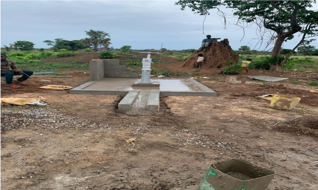
Drilling of 3No. Boreholes fitted with hand-pumps at Abotantri, Mossi Panin and Offei