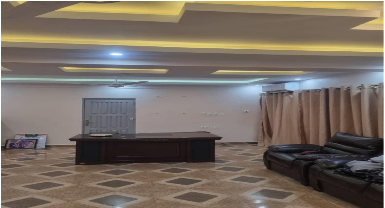
Rehabilitated Magistrate Bungalow