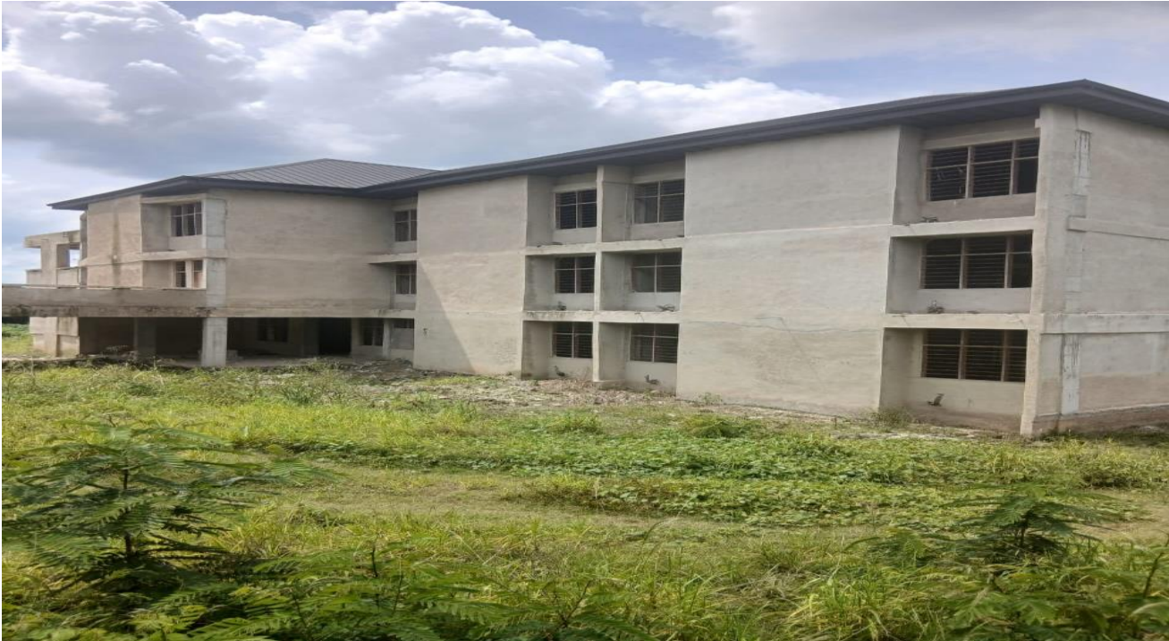
Rehabilitated MCE Bungalow at Offinso Adukro