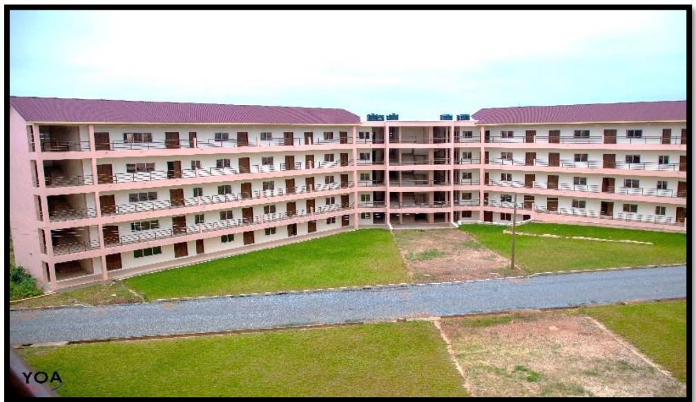
Figure 7: Abomosu STEM Senior High, Eastern Region

In view of the above, the STEM Senior High Schools portal for prospective students in the 2023 school placement and selection process was introduced.