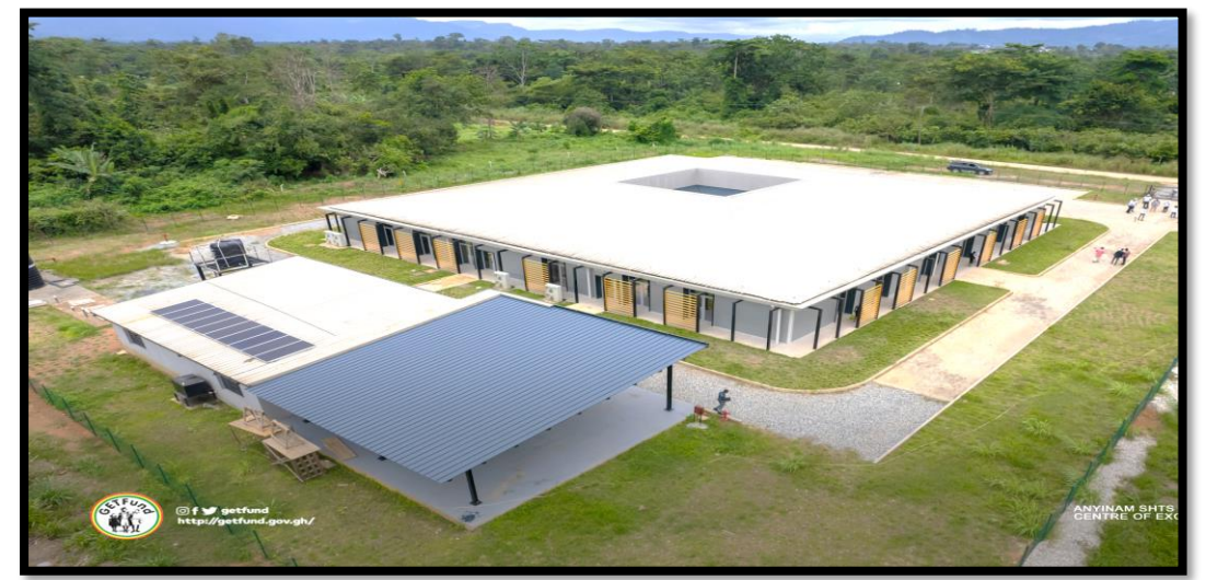
Figure 10: Newly Constructed TVET Centre of Excellence At Anyinam

Government also continued with the upgrading and modernization of thirty-five (35) Technical Institutes across the country as part of efforts to increase access and the quality of delivery of TVET Education in Ghana. Government also continued with the implementation of the Voucher Programme in the TVET sector to expand skills training opportunities. A total of 18,087 people have so far benefited from the programme.