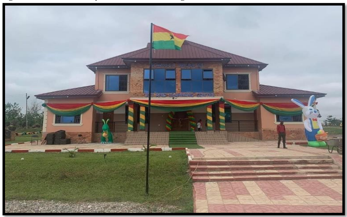
Figure 6: Kwaku Biakye ICT and Learning Center

Government also continued with the implementation of the Hands-on Mobile ICT Project to equip pupils in primary schools with practical ICT skills using the Mobile Library Services. Specifically, 490 Mobile Library Van outreaches were conducted in elementary schools across the country. The Authority hosted 168 personality reading sessions, and trained 412 youngsters in digital literacy. These efforts aimed to promote literacy and digital skills among children, fostering a positive impact on education and literacy.