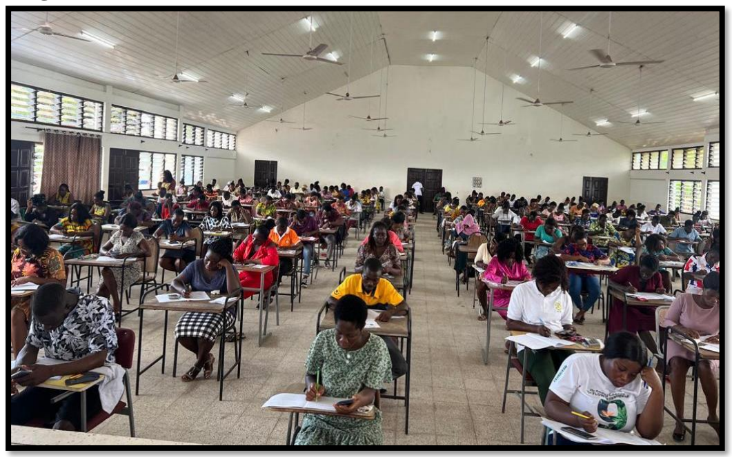
Figure 1: Teachers At the Examination Hall for the GTLE

In 2023, the National Teaching Council (NTC) conducted Ghana Teacher Licensure Examination (GTLE) for a total of 29,909 candidates and has subsequently licensed a total of 8,782 teachers across the country, bringing the total number of licensed teachers to 306,453. This was done as part of efforts to at streamlining the professional and career progression of teachers within the appropriate competency framework in the pre-tertiary sector. For the same period, a total of 28,791 newly qualified teachers who completed Colleges of Education were inducted.