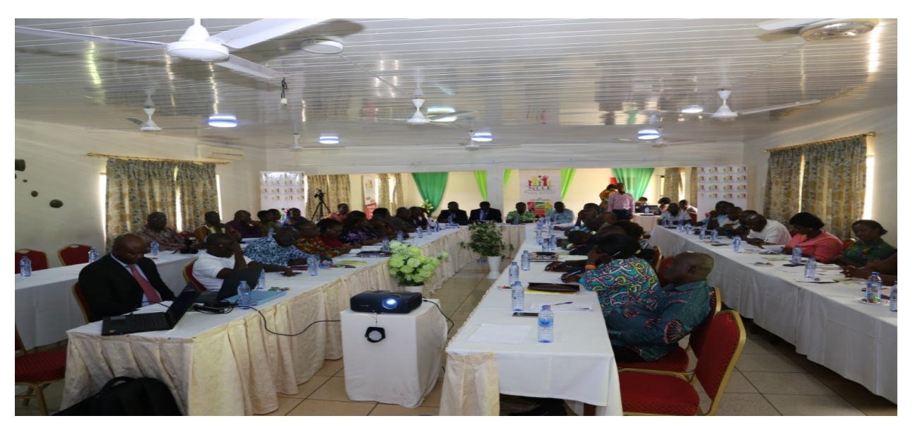
CAPACITY BUILDING ON PFM ACT, 2016 (ACT 921) FOR SELECTED STAFF 1