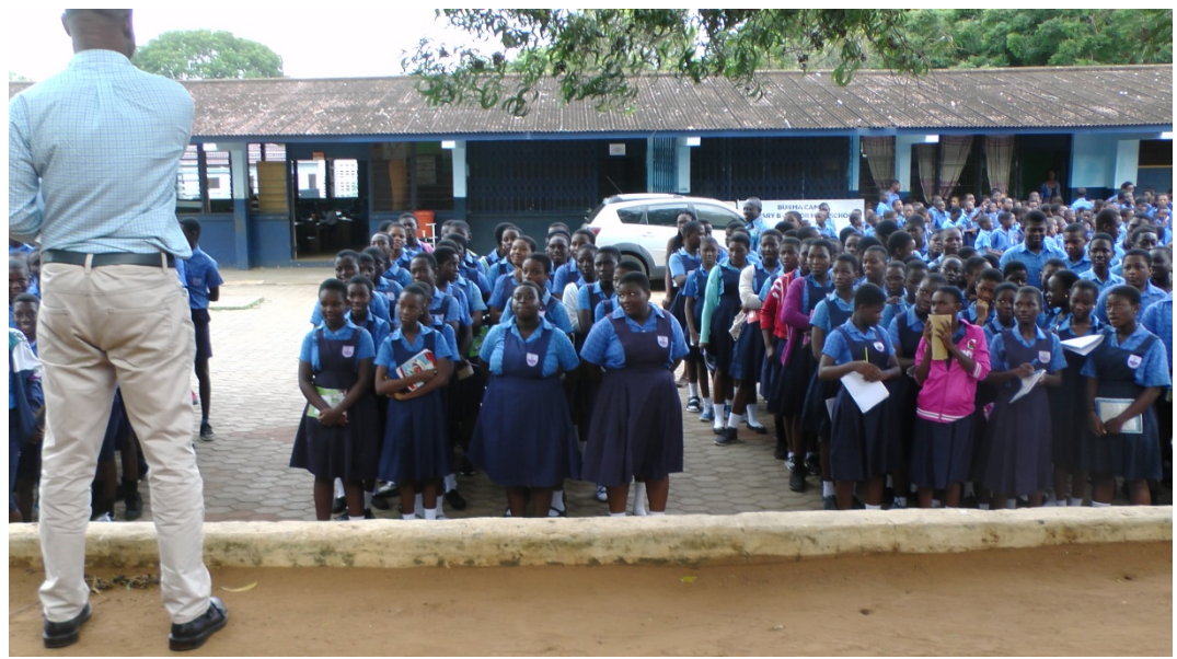
PUPIL OF BURMA CAMP JHS 1

Semi-Final and Final Inter-University Quiz/Debate was organised under the theme "Restoring our Ghanaian Values as Active Citizens. The competition which was also dubbed "Civic Challenge" elicited students' knowledge of the 1992 Constitution and their readiness to defend it.