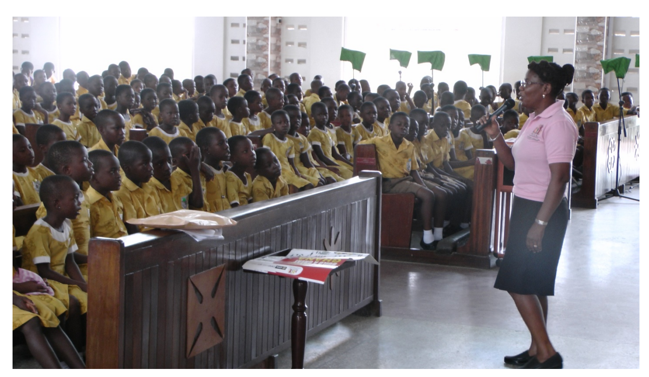
CCA DIRECTOR ON TAX EDUCATION 1

• The Commission had engagements with the Security Services on transparency and accountability during this year's Constitution Week Celebration. The Security Services are Ghana Immigration Service, the Ghana National Fire Service, the Armed Forces, Ghana Prisons Service and the Ghana Police Service. The programme was to promote discipline and patriotism among the security services. It was also to remind them that they are stakeholders in the consolidation of democracy;