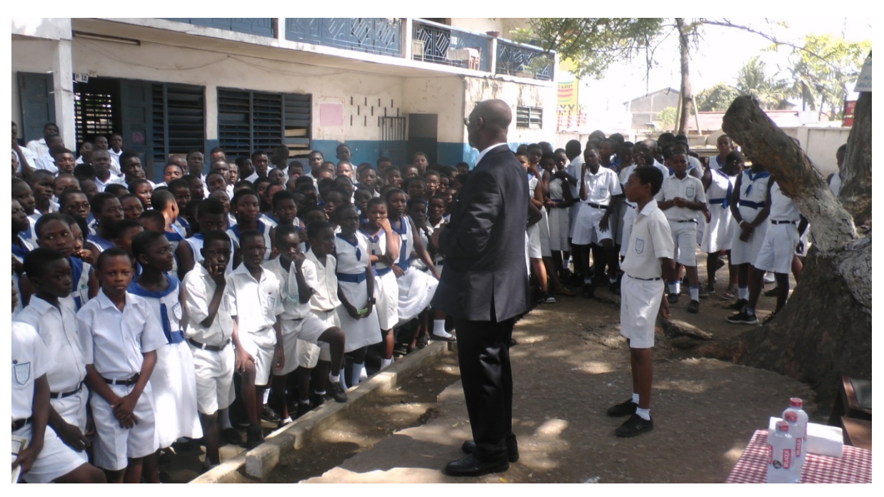
TAX EDUCATION BY GRA BOSS 1