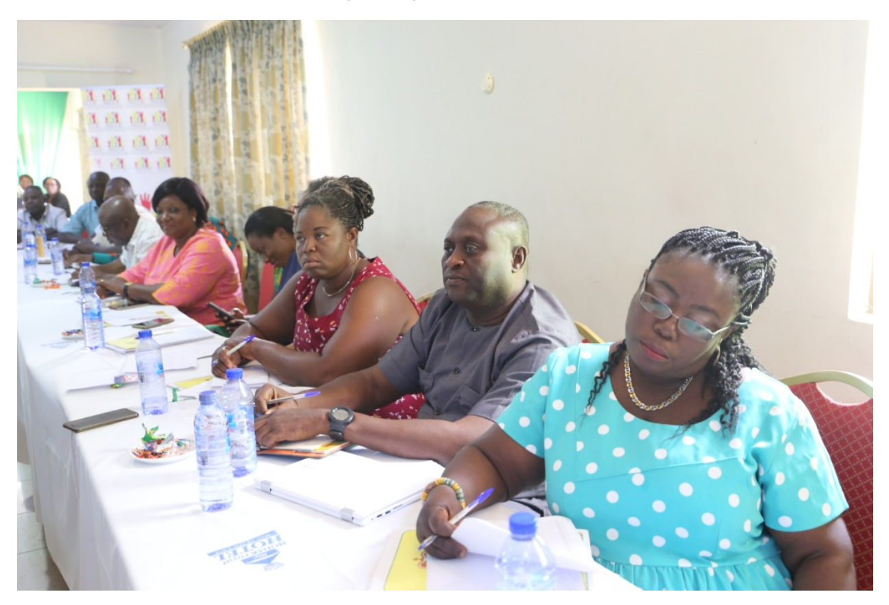
CAPACITY BUILDING FOR SELECTED STAFF 2