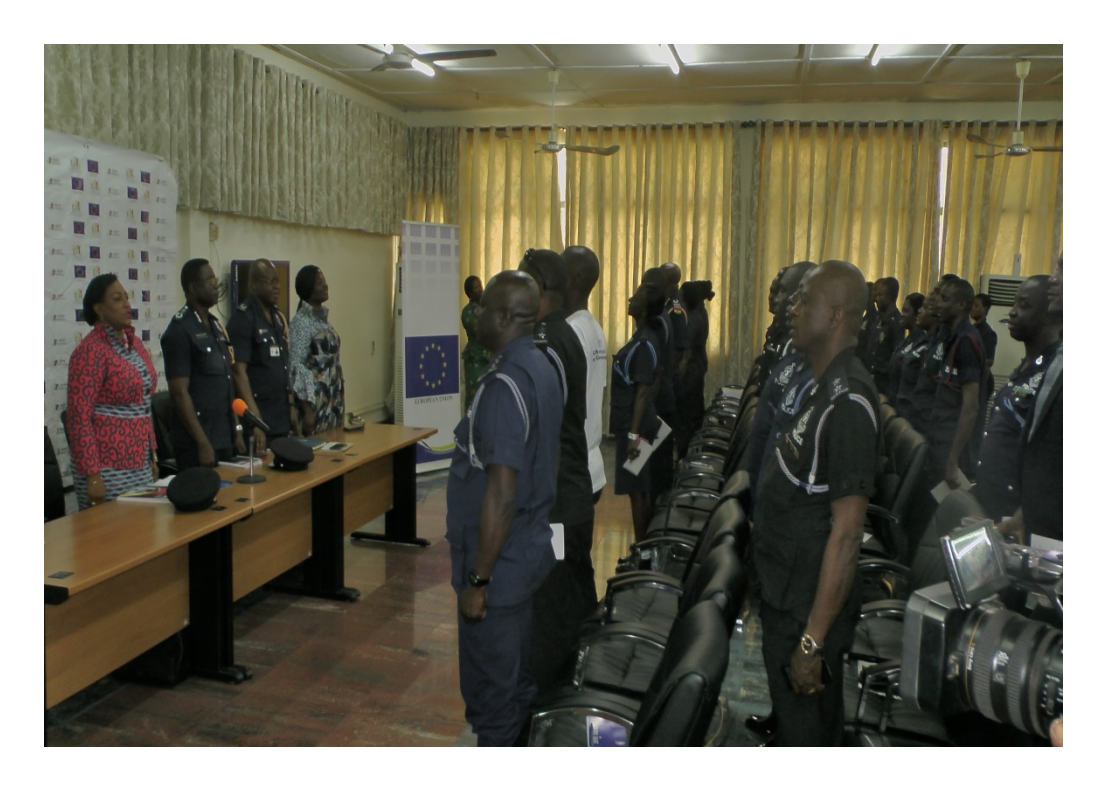
MAD NKRUMAH WITH GHANA POLICE SERVICE 1