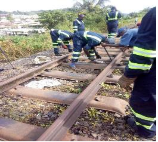
Construction of Western Line Kojokrom – Manso (Standard