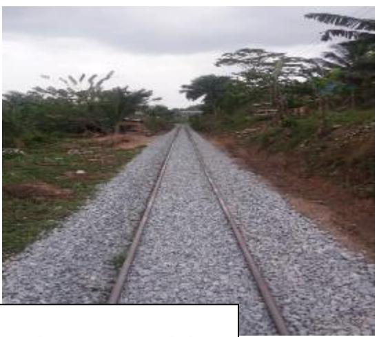
Ghana – Burkina Railway Interconnectivity Project Engagement