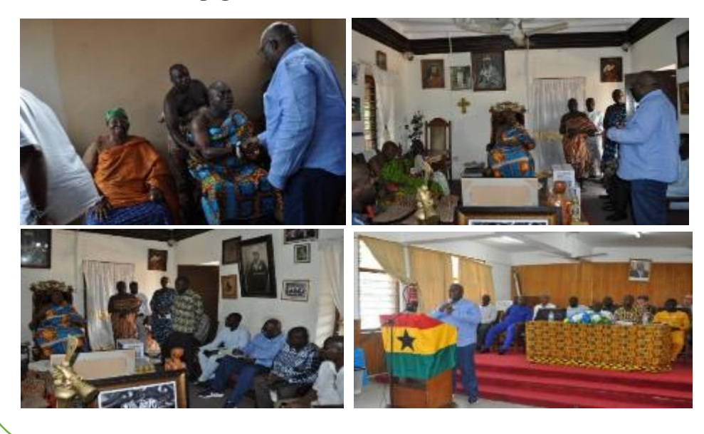
Tema - Mpakadan (Akosombo) Rail Project: Stakeholder Engagements / sensitization exercises.