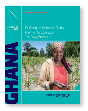
Ghana Diagnostic Study (2017) Betther Than Cash Alliance

To actualize government's vision as well as to facilitate and fast-track the shift to digital payments, a Digital Payments Roadmap has been drawn up by the Ministry of Finance with support from the Better Than Cash Alliance. It is based on the above documents, results and recommendations from the Ghana Diagnostic Study (2017) , as well as several workshops and stakeholder meetings.